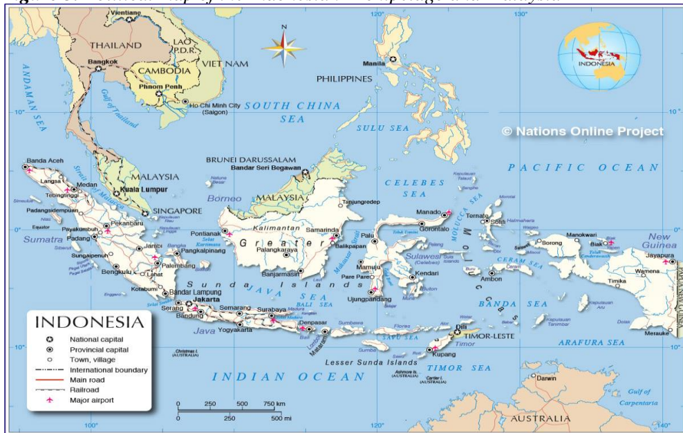
Figure 3. Political map of the Indonesian Archipelago and Malaysia 35

This is how Chinese naval base location in the islands of Sumatra and Kalimantan, for example, exert direct influence not only upon the Straits of Malacca but also on the rest of the region, as can be seen in Fig.2. Chinese military plans in Indonesian waters are supported by a strong community of Chinese nationals and companies operating in the region reunited in the so-called bamboo network 36 . According to the 2010 census, there are more than 2.8 million Chinese living in the Indonesian Archipelago, representing 1.2% of the total population of the country 37 . But unofficial sources claim that the number of ethnic Chinese living in Indonesia would reach between 10 and 12 million people, including some who are 3rd and 4th generation, but who declared themselves Indonesians.