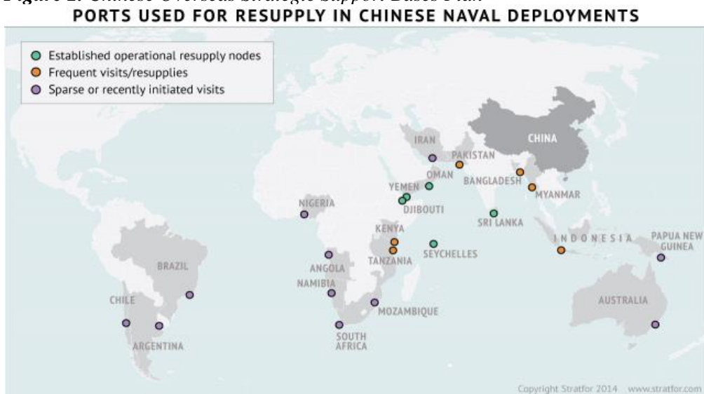
Figure 2. Chinese Overseas Strategic Support Bases Plan 12

Information regarding Chinese plans to construct a string of 18 naval military bases along the southern shores of the Afro-Eurasian continental mass was originally unveiled in International Herald Leader, 10 a newspaper affiliated to the Chinese national media agency Xinhua News Agency, on January 4, 2013. A year later, the American agency Stratfor published an analysis 11 of the Chinese military plan in the Indo-Pacific area drawing additional public attention to the inclusion in this plan of three other South American states,,: Argentina, Chile and Brazil (Figure 2).