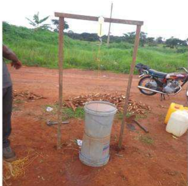
Plate 3. Set up used in estimating the starch content of fresh root of cassava in the field