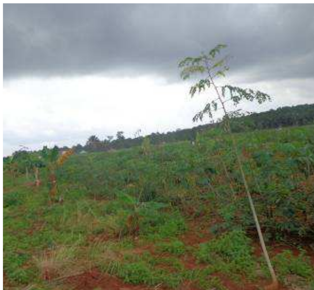
Plate1: Moringa and plantain planted in one row along one alley and cassava in the next alley

The field was ploughed, harrowed by tractor, and then alleys of plantain and moringa were established at 5 m apart and 6 m along the alleys in May 2017. Plantain was planted at 9 m apart and moringa was planted in-between the plantain stands giving a plant population of 1111 plants ha -1 . Ridges were made by tractor between the alleys and two improved IITA cassava varieties TMS 30572 known as "Agric" and IITA-TMS-IBA070539, known as "Yellow root", in the study area, were planted at 0.5 m by 1 m giving a plant population of 20 000 plants ha -1 (Plate 1). Poultry manure was broadcast at the rate of 8 t ha -1 on the harrowed plots before ridging. Again, poultry manure was also applied to the plantain at 0.5 kg stand -1 . Both rates approximate farmers' practice in the area. The two cassava varieties were arranged in a completely randomized block design (RCBD) replicated three times. In the second week of February 2018, ≈ 10 months after planting, the entire field was burnt by unknown persons (Plate 2). The burning was facilitated by the undergrowth of dry grass and dry portions of the crops.