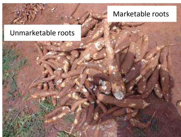
Plate 10. Cassava sorted into unmarketable and marketable fresh roots categories at 6 MAB