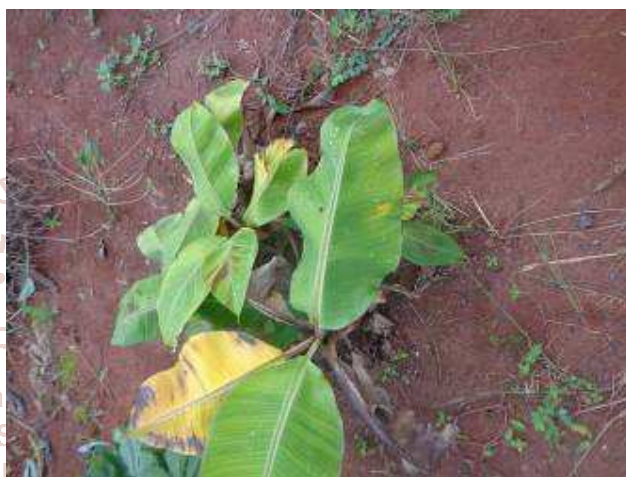
Plate 5: Another two impoverished regenerated plantain stands from the same spot at 6 MAB