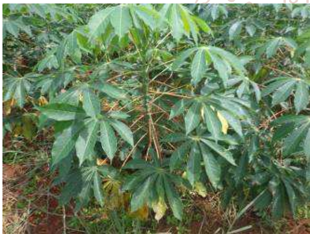
Plate 8: Flourishing Yellow root at 6 MAB

The results clearly showed the superiority of cassava over plantain and moringa when subjected to bush fire. This resistance to fire agrees with established facts that cassava is a reliable food security crop 3,1 . It also raises the hope of cassava farmers whose farms are subjected to frequent bush fire by hunters of bush animals.