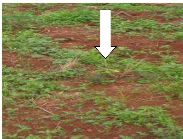
Plate 7. Impoverished regenerated moringa stand at 6 MAB