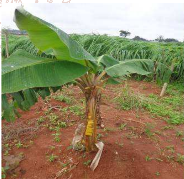
Plate 6. Plantain stand at the edge of field not affected by fire

The effect of fire appeared worse on moringa than on plantain. This was evident by < 4% of the original stands of moringa that was counted at 6 MAB (Table 1). The moringa stands also appeared impoverished (Plate 7).