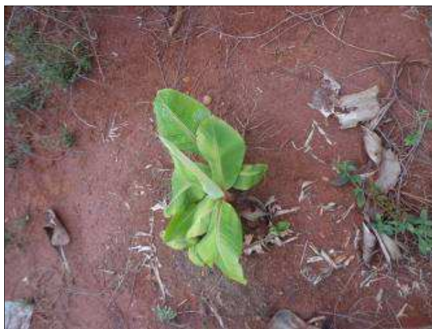
Plate 4: Impoverished regenerated plantain stand at 6 MAB

The status of the field when the farm was burnt in February 2018 is shown Plate 2. The entire field appeared charred with no hope of any crop re-growing. The number of plantain that regenerated at 6 MAB was < 5% of the original stands (Table 1) and the regenerated stands appeared very impoverished (Plate 4 and 5) as compared with the plantain stand at the edge of field not affected by fire (Plate 6).