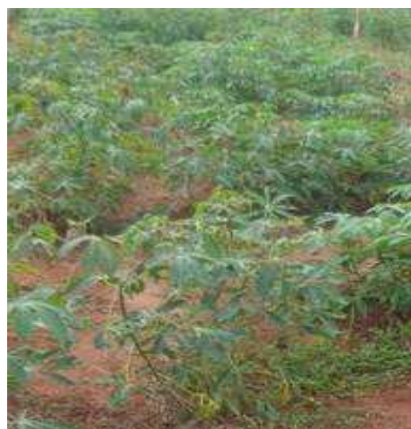
Plate 9: Flourishing TMS 39572 (Agric) at 6 MAB

In contrast, the mean number of cassava stands counted at 6 MAB was > 90% (Table 2) and the cassava stands looked well nourished (Plates 8 and 9).