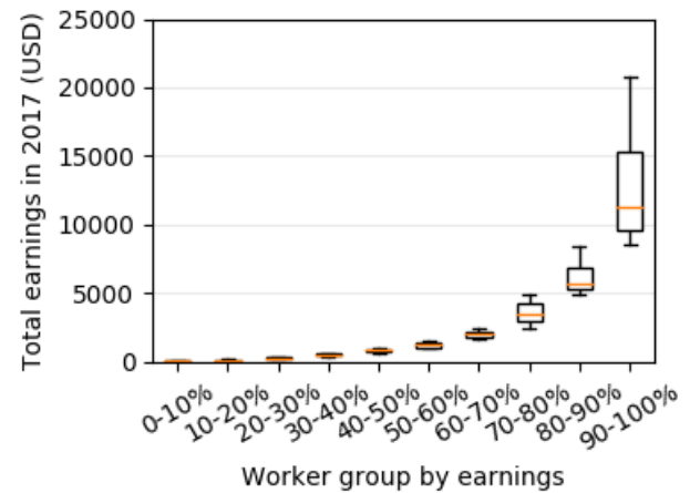
Figure 3: Distribution of workers’ total earnings in 2017 (split into 10 groups based on earnings.) We define the top 10%, indicated as “90-100%”, as high-earning extremes.

High-Earning Extremes. We define the top 10% of earners in our survey as high-earning extremes and further examine what habits and strategies these workers are using