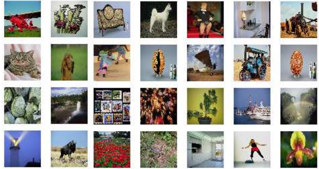
Figure 2. Some images selected from COREL image CDs in our experiment

car , cat , dog , firework , horse and lizard , etc. Fig. 2 shows some images used in our experiment.