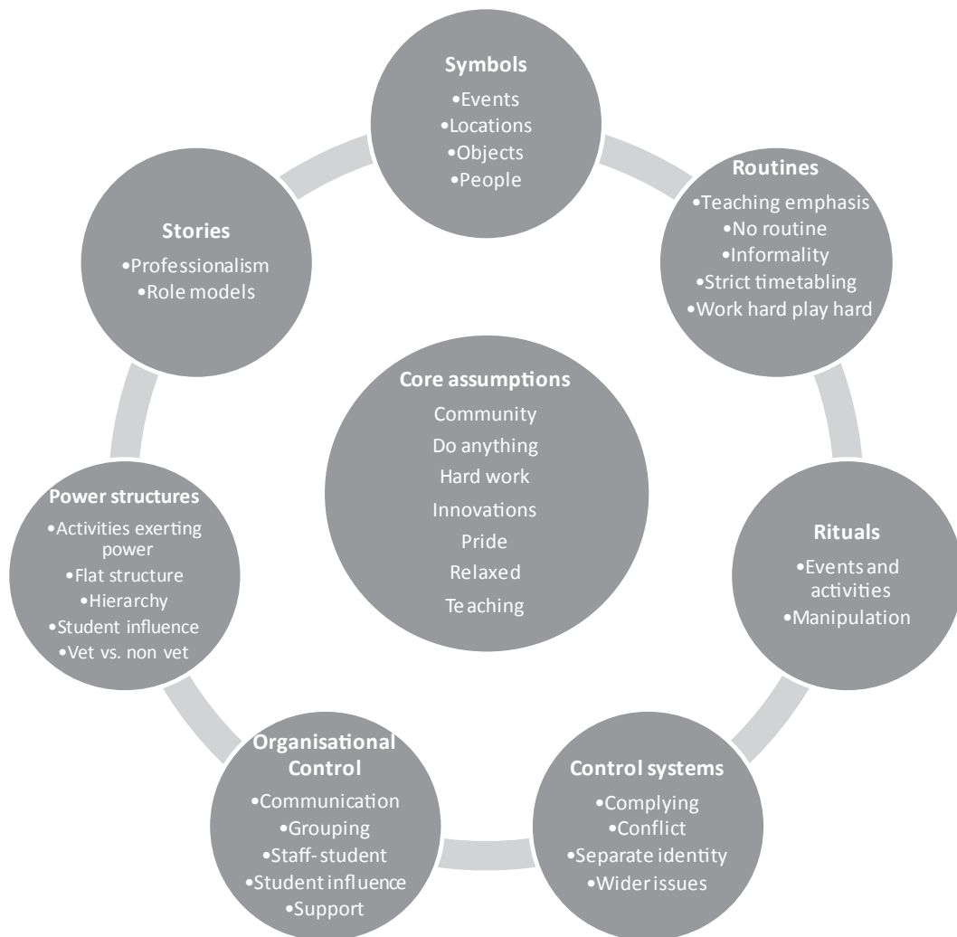
Figure 2 Issues contributing to the hidden curriculum identified using the cultural web 22 as a model

Participants judged their environment as innovative and experimental, as might be expected in a new school; risk taking was discussed as an element of this: