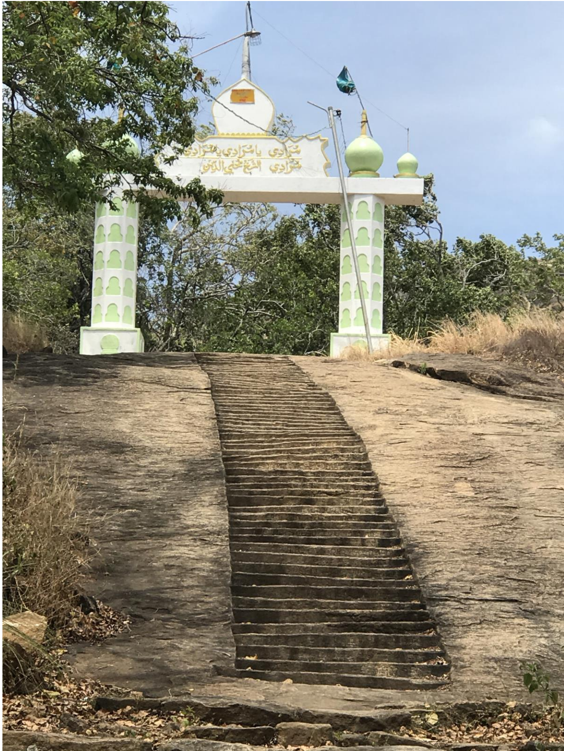
Fig 2: The Muslim 'Torana' beside the rock-cut steps to Kuragala

Muslim names, is through a large white entrance arch with green minarets on either side. This flamboyant arch, with Islamic motifs, was constructed in 1982 (Aboosally 2002: 64). Some local residents identify this new construction as a “Muslim Torana”, (Figure 2) the latter being a specific religious emphasis and designation usually associated with Buddhist sites.