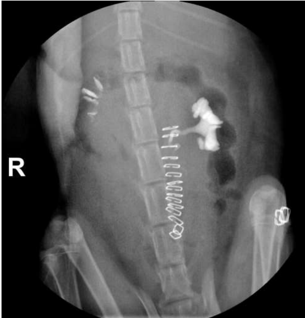
Bilateral pyelography demonstrating bilateral hydronephrosis, failure of opacification of entire right ureter and distal left ureter. Skin staples are present along the ventral midline and left flank from previous ovariohysterectomy procedure.

1 2 3 4 5 6 7 8 9 10 11 12 13 14 15 16 17 18 19 20 21 22 23 24 25 26 27 28 29 30 31 32 33 34 35 36 37 38 39 40 41 42 43 44 45 46 47 48 49 50 51 52 53 54 55 56 57 58 59 60