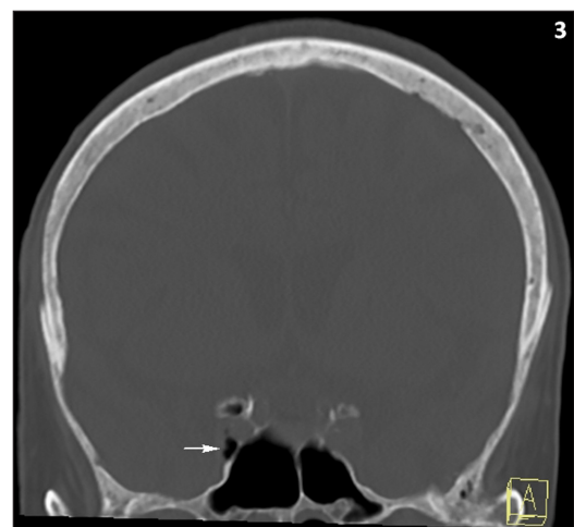
Figure 3: CT of the skull, bone window, coronal reformatted image. Air bubbles at sinus cavernosus (white arrow). Normal pneumatisation of the sphenoid sinuses and absence of a fracture.