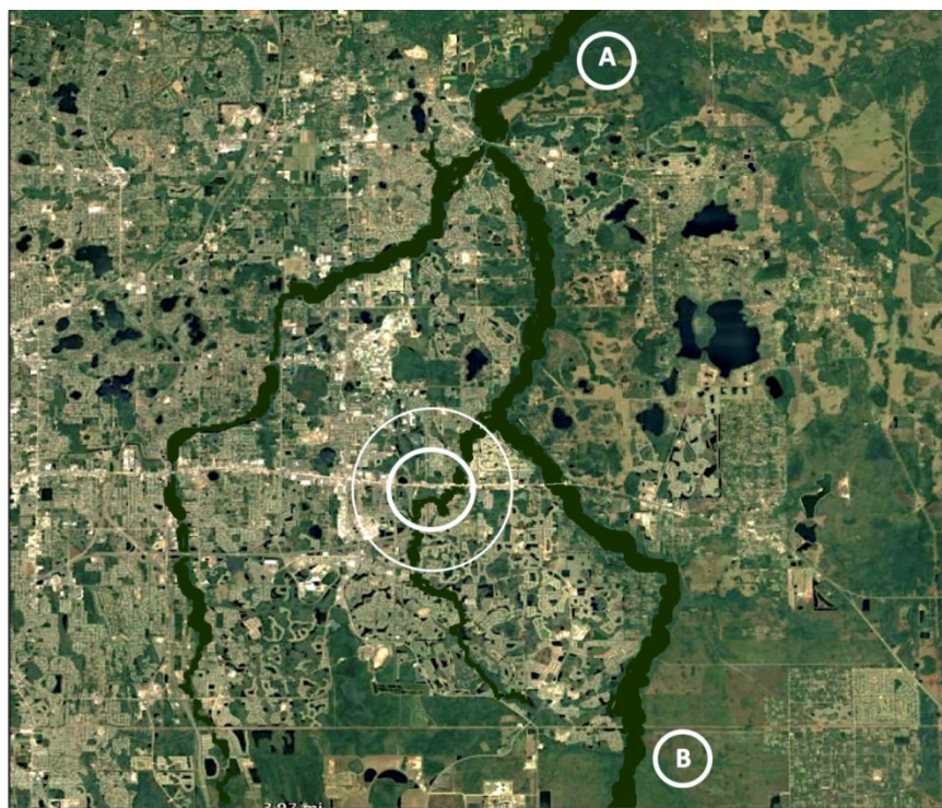
Figure 2. Satellite graphic showing the Koontz site (double ring), the sinuous Econlockhatchee watershed, and the alternative A & B offsite mitigation proposals. “A” represents the proposed drainage ditch corrections at the Little Big Econlockhatchee State Forest. “B” represents the proposed culvert repair at the Hal Scott Regional Preserve.

Option 3 (open-invitation): Third, the water district staff invited Mr. Koontz to suggest a mitigation action proposal of his own choosing, building upon any suggestions from his hydrology expert that would proportionately offset the loss of wetland hydrological and ecological storage on the subject parcel. 39 Mr. Koontz apparently took no steps to address this option.