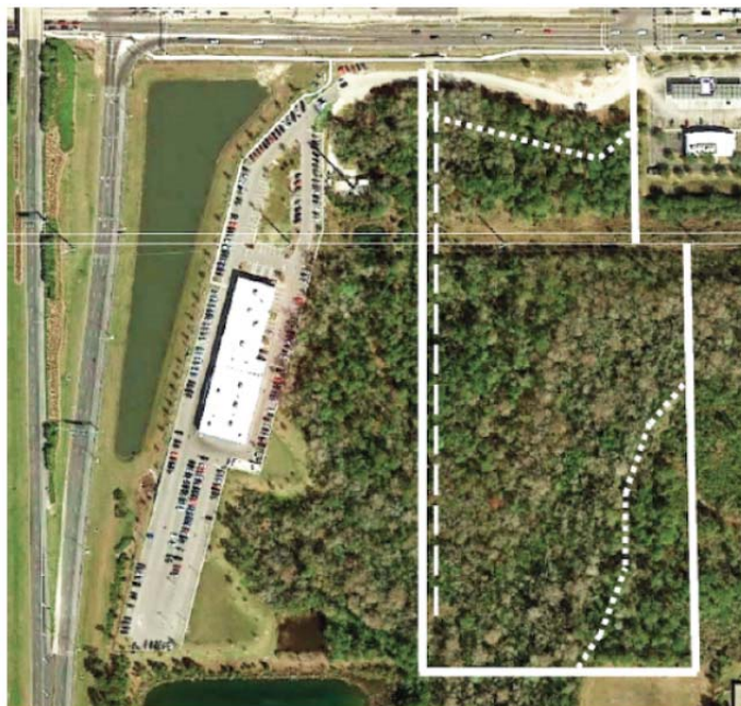
Figure 1. The Koontz Site (solid rectangle lines), with designated upland area (lower dotted line), one-acre fill + existing upland developable area (upper dotted line, schematic), small westerly drainage ditch (dashed vertical), and a high-tension power-line easement (the horizontal double-line).

permit to fill the northern 3.4-acre wetland area and offered to give a conservation easement permanently restricting development on the remaining roughly eleven acres of wetlands in the southern interior of the property beyond the powerlines. 28