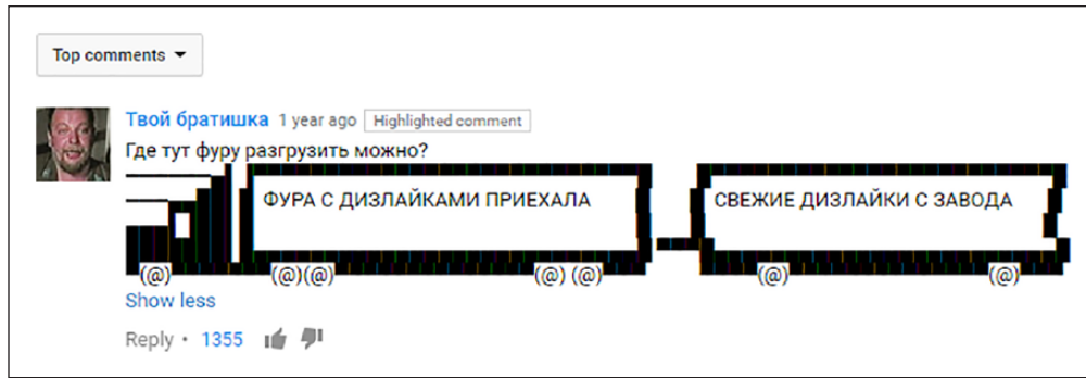
Figure 1. “Where can I unload this lorry? The lorry with dislikes has arrived || Fresh dislikes from the factory.”

that the DIY affordances of social networks encourage creativity. Moreover, an emotional reaction drives people toward ingenious decisions (Khan & Vong, 2014). This a humorous resistance to propaganda, which allows the user to conceal their oppositional stance behind a joke. We do not know whether they disliked the style of music or the political hypocrisy in it.