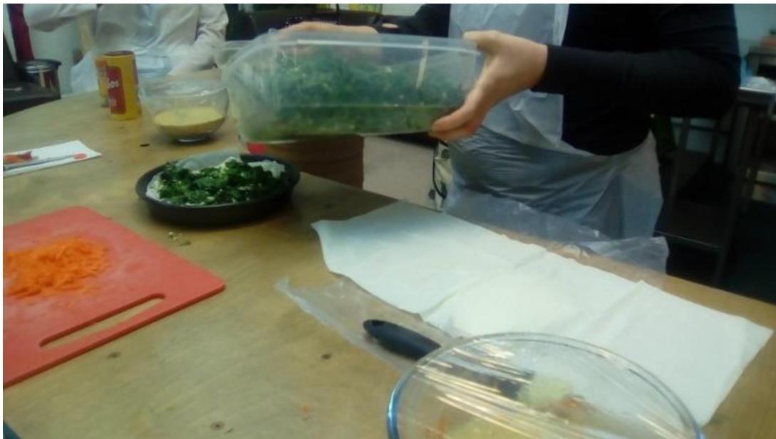
Image 5: Cooking classes is a key 'ingredient' of the food hubs in Preston (Fieldwork Photograph, May 2017)