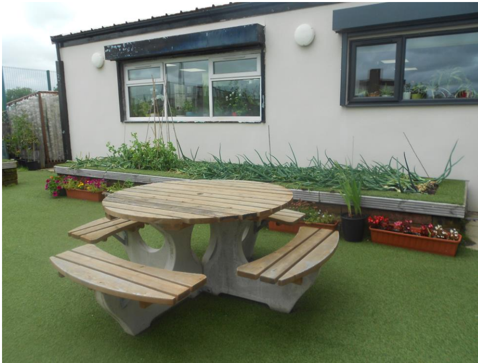
Image 3: View of the Garden of the collaborating Community Centre in Preston (Fieldwork Photograph, July 2017)