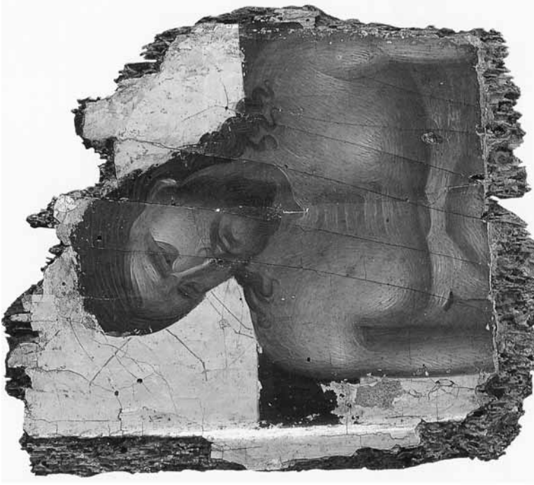
Fig. 3. Greece, Meteora, Transfiguration Monastery, Diptych, the Lamenting Virgin and the Man of Sorrows, third quarter of the 14th century