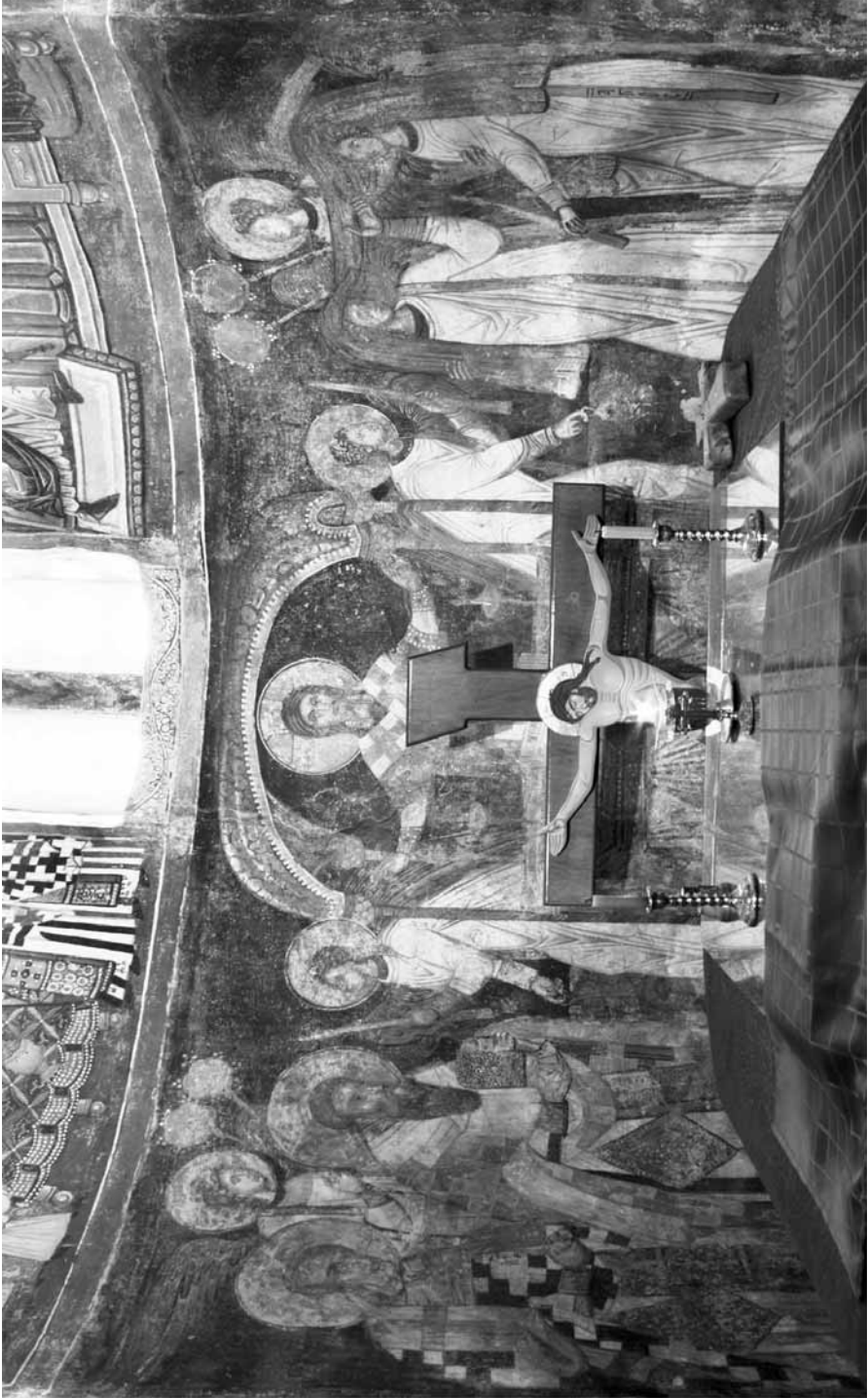
Fig. 7. Markov Manastir, Great Entrance with Christ the Archpriest