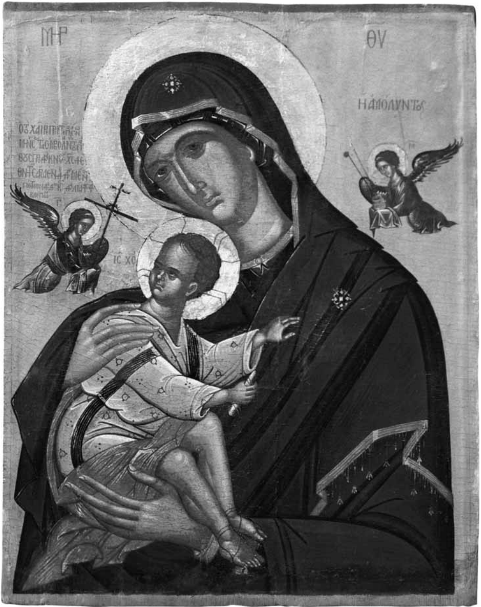
Fig. 10. The Collection of the former Greek queen Frederika, The Virgin of the Passion, Η ΑΜΟΑΥΝΤΟΣ, 15th century