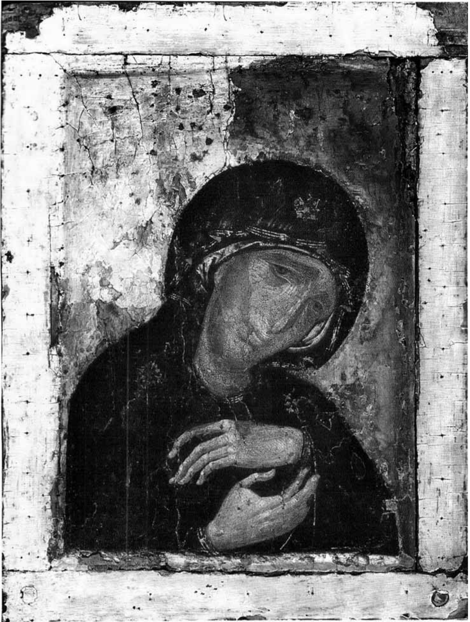
Fig. 4. Moscow, Tretyakov Gallery, icon of the Lamenting Virgin, late 13th century