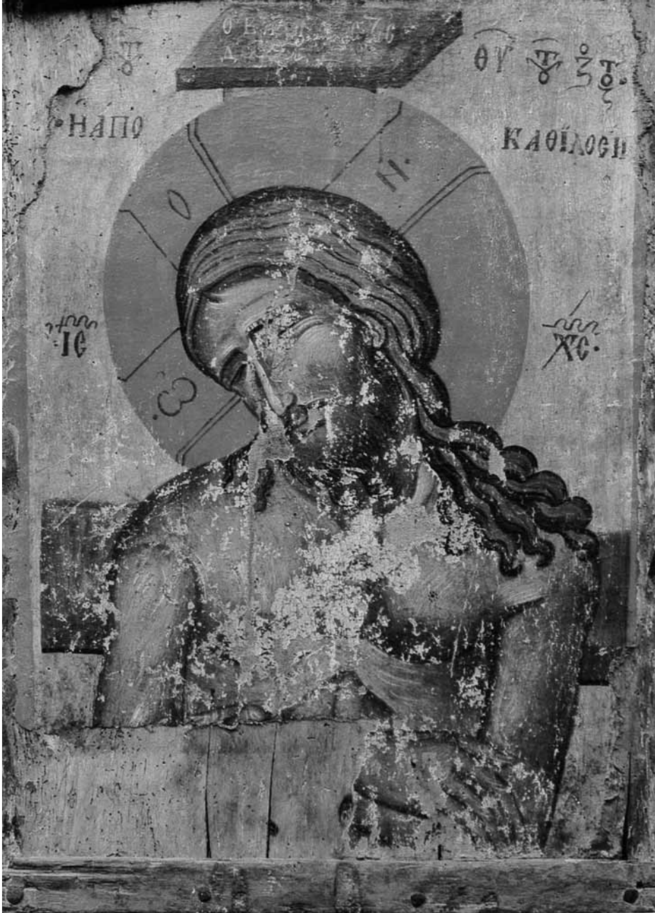
Fig. 5. Serbia, Poganovo Monastery, icon of the Man of Sorrows, c. 1400