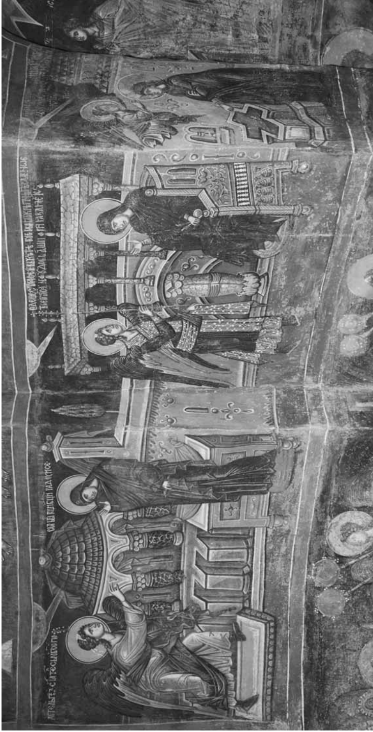
Fig. 8. Markov Monastir, Akathistos Hymn, 1–4 oikoi