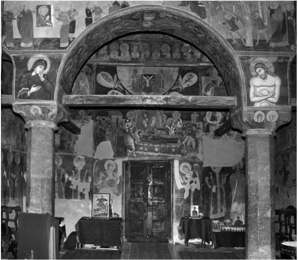
Fig. 2. Markov Manastir, frescoes on the western wall of the naos