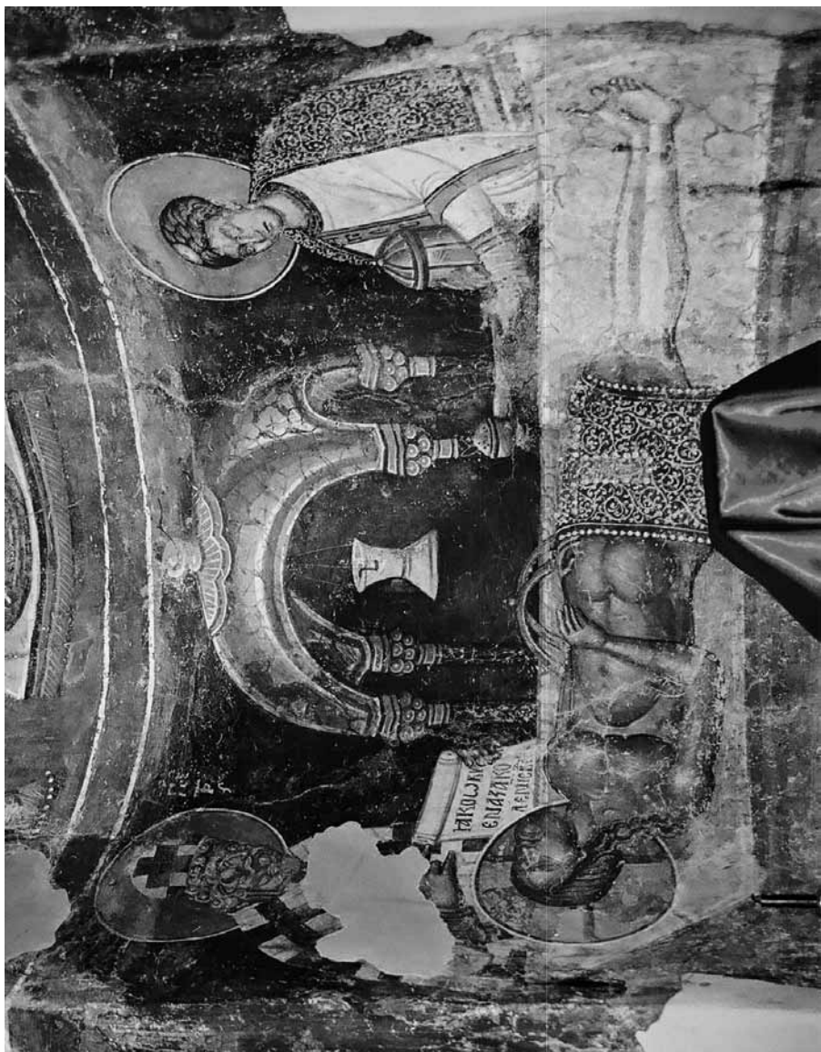
Fig. 6. Markov Manastir, Prothesis rite