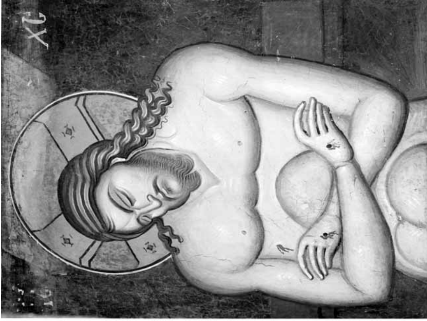
Fig. 1. Markov Manastir, the Lamenting Virgin and the Man of Sorrows