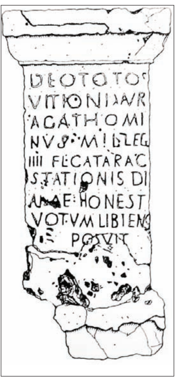
Fig. 2 Inscription from Djerdap Gorge (drawing after V. Kondić 1987)