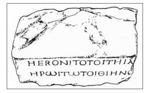
Fig. 4 Inscription from Svilengrad (drawing after Gerasimova 1999, p. 16, fig. 2)