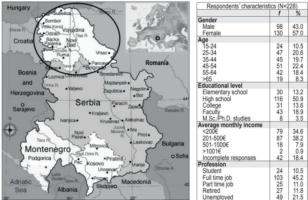
Figure 1: Analyzed study area and socio-demographic characteristics of respondents

indicator of the measurement scale acceptance. The sample in this research ( N \geq 51 ) is adequate for meaningful statistical assessments (Bagozzi, 1981).