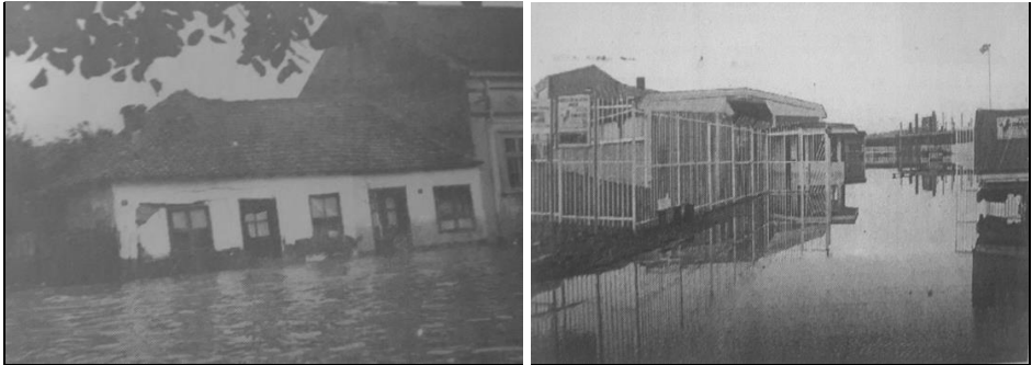
Figure 1. Floods in Despotovac, June 1969; Industry zone in Kragujevac under water, July 1999 (Archive of Inventory of torrential flood events in Serbia, "Politika")

26 th June 1988, Kostadinov, 1989: Torrential floods in the Vlasina river basin are the consequence of intensive rainfall episode - one third of annual rainfall is poured down in only 4 hours. 500 homes flooded, 80 km of roads and 32 bridges ruined, 3 casualties are the results of this flood event. There were floods of torrents in this river basin with return period of 800 years (Ravna reka).