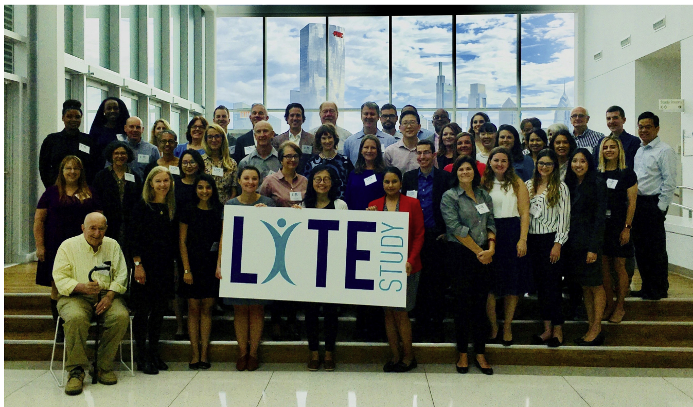
Figure 2. Stakeholders meeting for the LITE treatment effectiveness study. An in-person meeting of patient research partners and other stakeholders was held in September 2018 in order to achieve final input on the design of the LITE study. Patient input resulted in dropping one secondary end point in order to reduce burden to study subjects.

investigator and co-principal investigator (both dermatologists) and others were nominated by National Psoriasis Foundation staff, thus ensuring inclusion of highly motivated patients who are have deep experience of living with psoriasis. The application, which detailed our plan