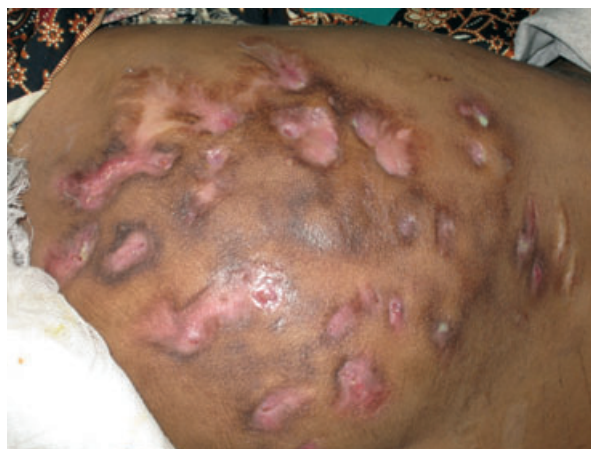
Figure 1 Cutaneous melioid affecting the buttock.

A diagnosis of melioidosis was made, and the patient was treated with intravenous ceftazidime (2 g