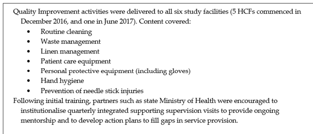
Figure 1. Details of Maternal and Child Survival Program (MCSP)-support quality improvement (QI) programming. HCF: healthcare facility.

essential newborn care, and quality of care. Time dedicated to hand hygiene training was limited during the training programme. For example, it constituted just 10 min of the essential newborn care course and did not include skill practice. More specific quality of care improvements are detailed in Figure 1.