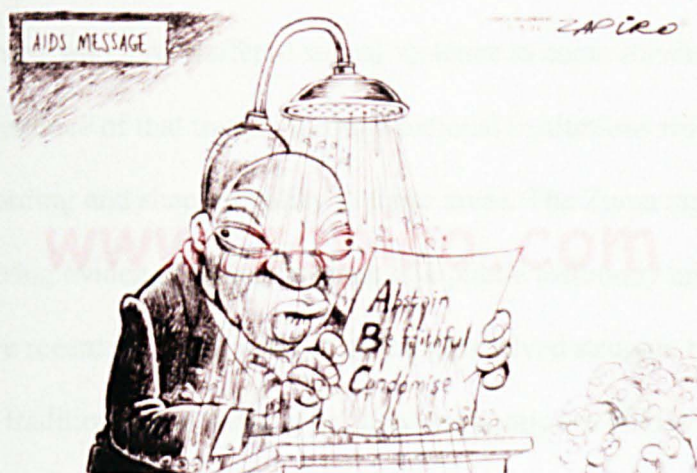
Illustration 4. 434

Ideas about rape embedded in the Zuma rape trial were therefore ‘overtly present in the “text” and “performance” of the trial’. 435 The trial’s text also points to notable omissions, including observations by Zulu diviners that ‘Zuma’s behaviour constituted a form of social incest taboo in the culture he vigorously appropriated to support his behaviour’ 436 and in his lack of remorse or provision of evidence to substantiate his claim that he was HIV-negative.