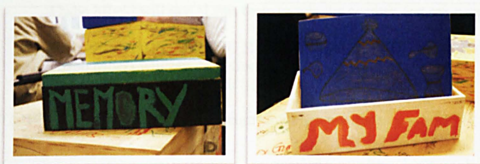
Illustration 5: 543