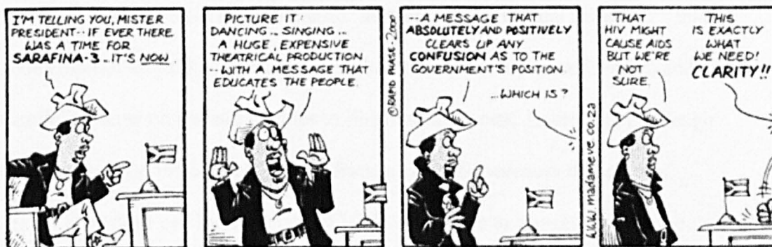
Illustration 1: 130

Brink also declared Sarafina II to be a failure. Isolating the large scale of the production alongside its emotionally demonstrative content, his use of the term ‘spectacular’ in the quote below implies both the inappropriate dramaturgy of the production, as well as the commercially exploitative nature of Sarafina II :