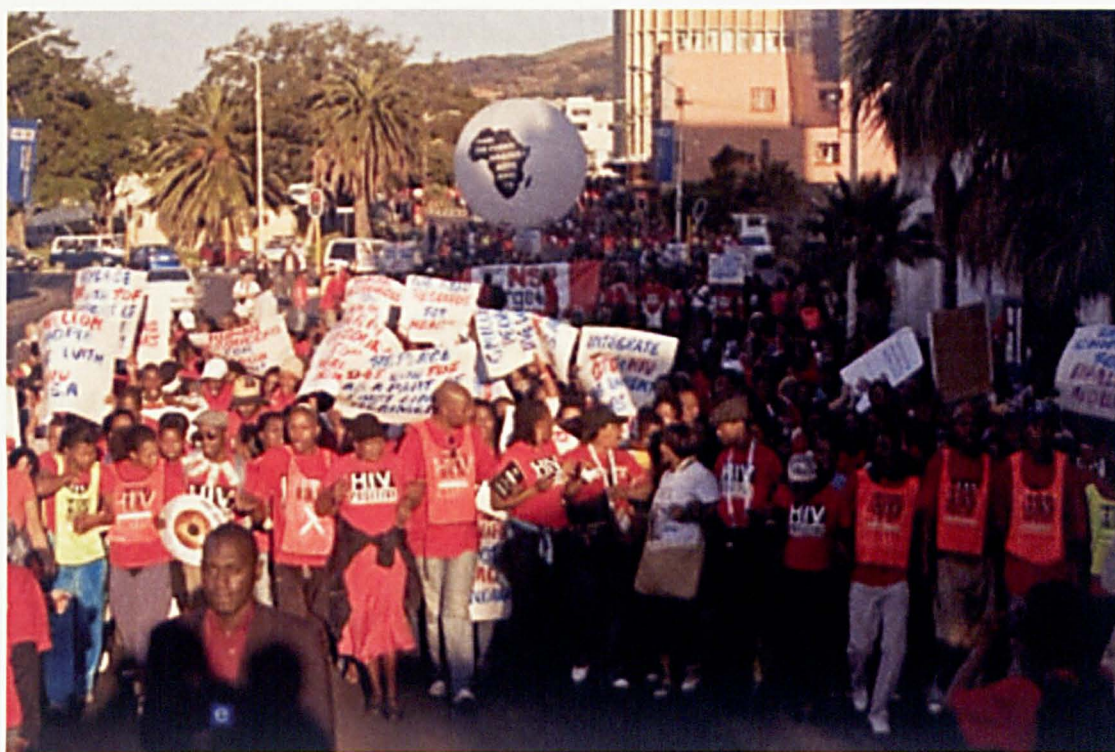
Illustration 2: 214

TAC: Taking HAART (Dir. by Jack Lewis. South Africa. 2011) focus on the struggle to acquire affordable antiretroviral medication in South Africa (and indeed, the global south). Both documentaries emphasise TAC's use of anti-apartheid tactics such as large-scale peaceful rallies and civil disobedience campaigns. 213 Footage of TAC comrades singing in their 'HIV-Positive' t-shirts presented in these films suggests the direct influence of South Africa's liberation caucus in the development of HIV/AIDS activism, as the following photograph of the 19 July 2009 march to the International Convention Centre in Cape Town displays.