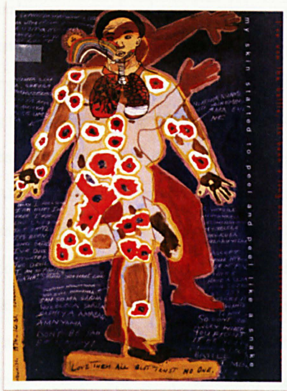
Illustration 6: 545