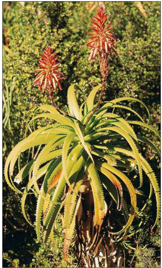
Figure 1. Aloe pluridens flowering north of Uitenhage, Eastern Cape Province, South Africa.