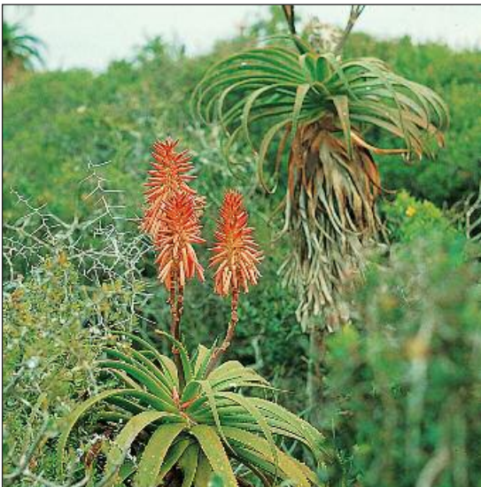
Figure 7. Aloe pluridens is a common species in the coastal and near-coastal parts of the Eastern Cape Province, South Africa. Its inflorescences are somewhat less dense than those of A. arborescens . Here the species is in flower in July 1995 at Blue Water Bay on the banks of the Swartkops River, near Port Elizabeth.