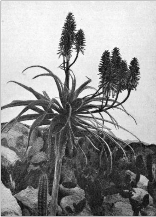
Figure 4. The first published illustration of Aloe pluridens from Berger (1900).

Glen, A. mutabilis Pillans, and A. vanbalenii Pillans. The species in this group range from virtually stemless ( A. vanbalenii ), through a pendent cliff-dweller ( A. hardyi ) and medium-sized to large shrubs ( A. mutabilis and A. arborescens ), to the somewhat tree-like A. pluridens and some forms of A. arborescens . Even though Glen & Hardy (2000) described the racemes of the species included in this group as “cylindric to conical”, all the species have conical racemes, if narrowly to elongated so, as in the case of A. vanbalenii . The flowers of all the species are narrowly cylindrical and pencil-shaped.