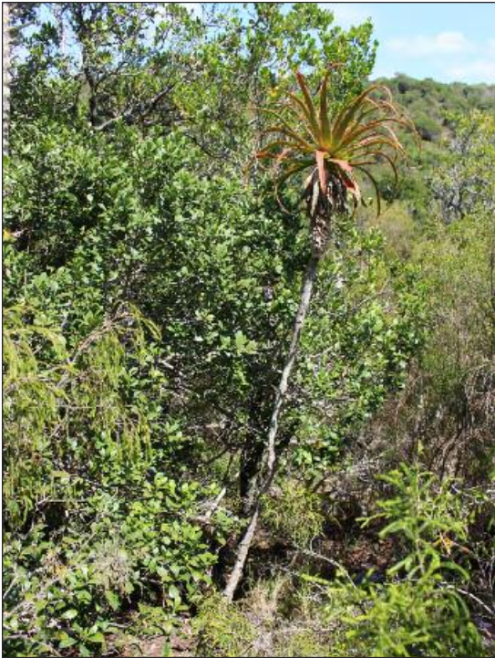
Figure 6. Aloe pluridens in habitat near to the Kariega River in the Eastern Cape Province of South Africa.