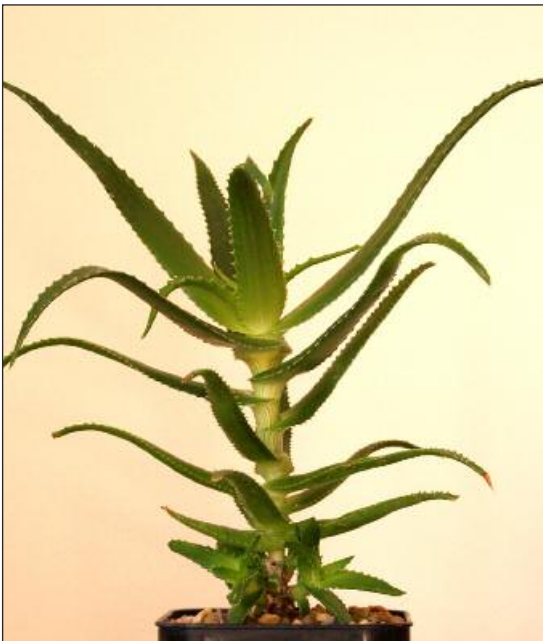
Figure 11. Seedling of Aloe pluridens , c. 4-year old, showing basal branching.