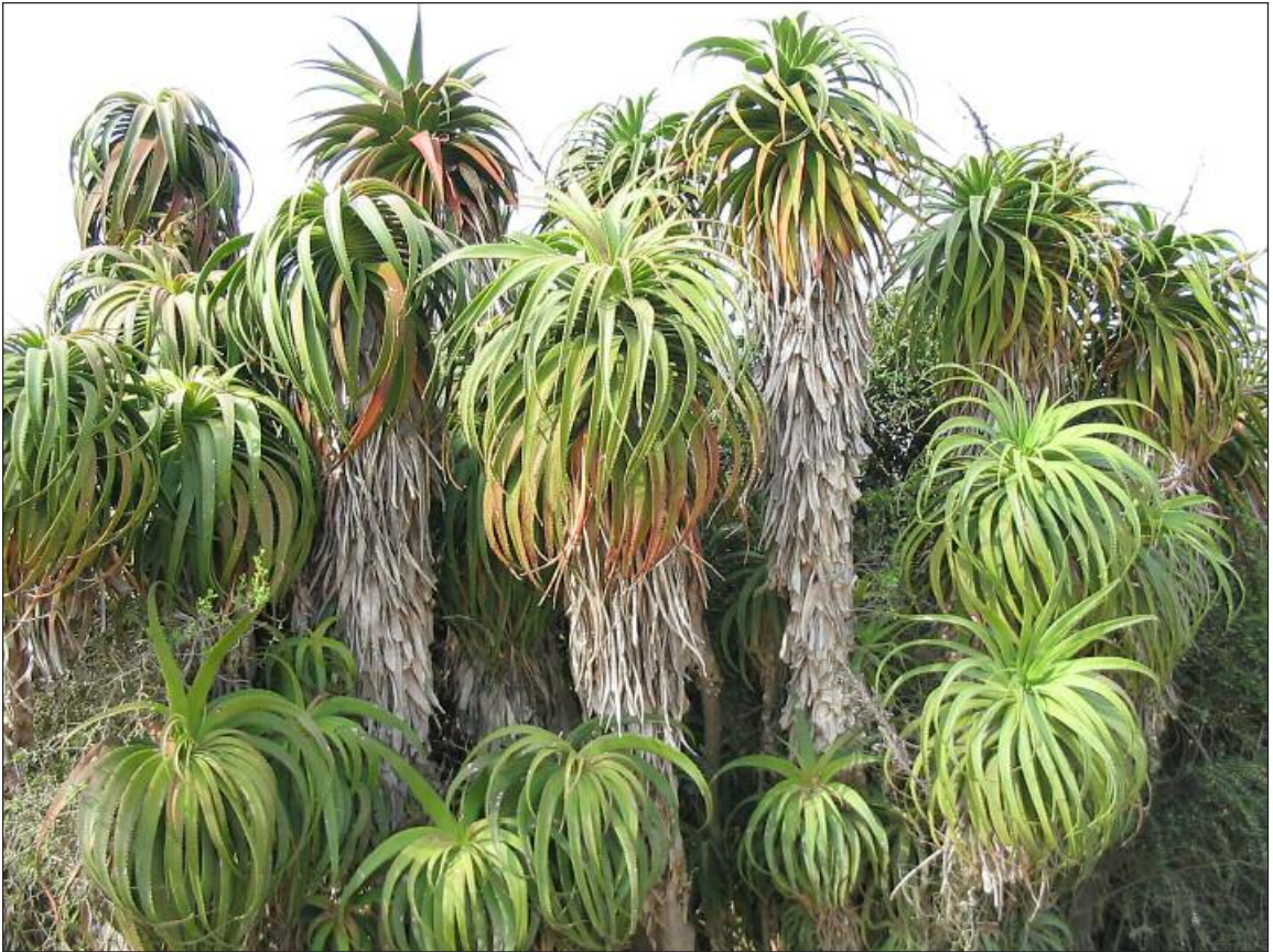
Figure 9. Several large, branched specimens of Aloe pluridens in habitat 7km north of Uitenhage, en route to Jansenville. The leaves are gracefully recurved and typically tilted to one side.