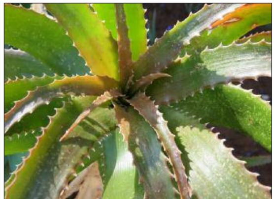
Figure 2. The leaf margins of Aloe pluridens are adorned with numerous, small, whitish to concolorous teeth.