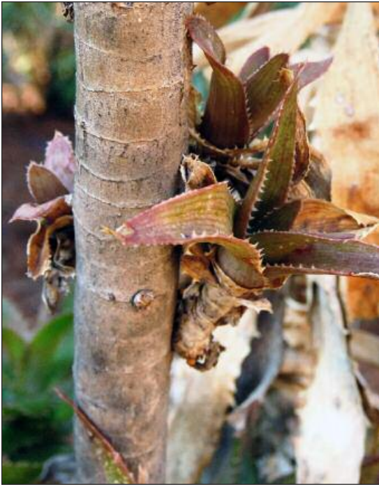
Figure 10. A profusion of plantlets often develops on the exposed parts of the stems of Aloe pluridens . Note the development of roots while the plantlets are still attached to the stem.