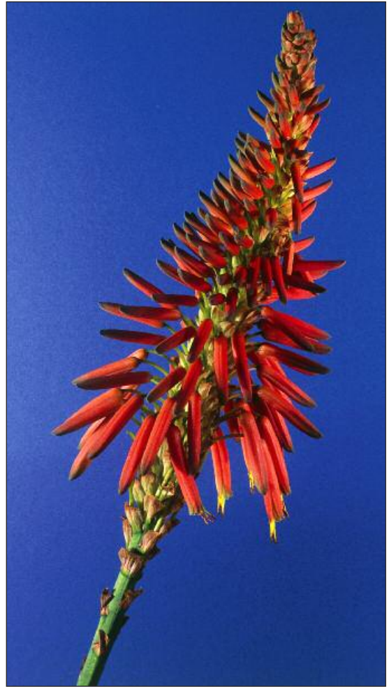
Figure 12. Inflorescence of Aloe 'Spiraal', a hybrid between A. mutabilis and A. pluridens .