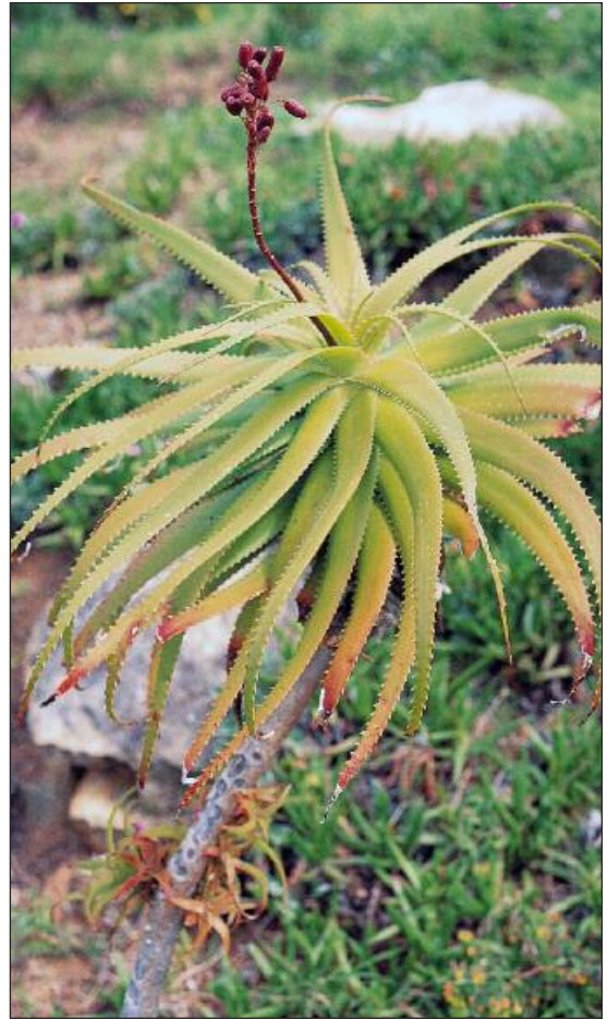
Figure 8. The fruit of Aloe pluridens is a characteristic reddish brown to chocolate brown colour.