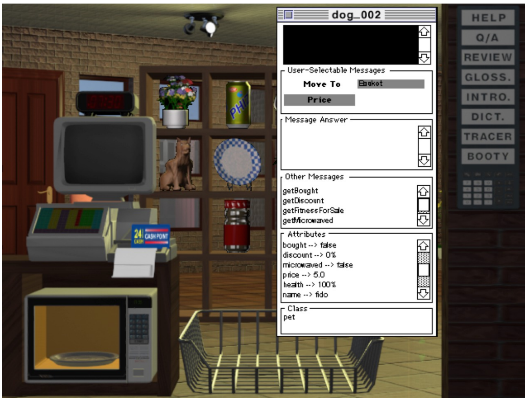
Figure 2: Floor 2 Articles In The Object Shop

candidates as one which would not demand an unnecessary 'knowledge overhead'. The task of shopping and bringing together (from a range of options) the items for a three course meal should be within the grasp of all possible students. Some illustrative domains (aircraft control, vehicle ignition systems, air conditioning systems) required significant background knowledge of the domain in order for the user to interact in any significant manner. The designers also had to keep in mind whether the illustrative domain would appeal to all age ranges and both genders (or at least not alienate any one group).