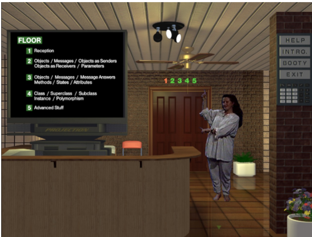
Figure 1: Entrance To The Object Shop