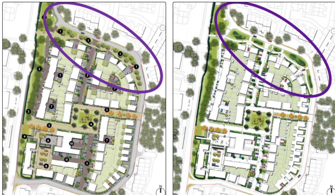
Fig. 3 Pedestrian character area (Rural-urban extension 2) with trees (2014, left) and trees removed when utilities were redesigned (2015, right)

were heavily 'front-loaded', conducted early during the outline design stage and driven by planning rules and norms. During the later detailed design and construction stages, however, GI-related evaluations were conducted more intermittently. They were also often conducted by consultants peripheral to the core design team, which, in turn, weakened the evaluative accountability of central decision-makers at the latter stages. For example, a landscape architect (at Infill 2) described how the design team seemed unaware of the evaluative recommendations that had arisen from an earlier ecology survey: