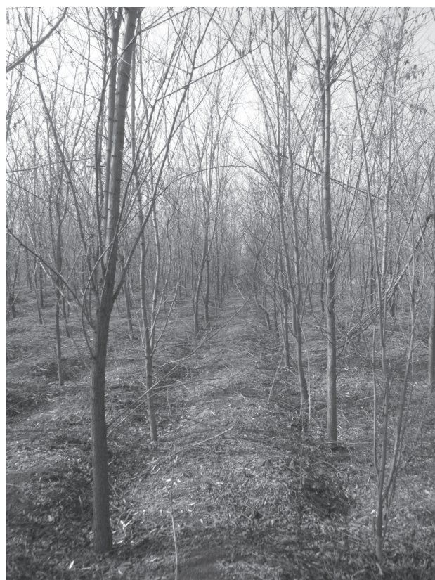
Fig. 2 Short rotation energy plantations of black locust on tailing dump of »Field B« open pit in »Kolubara« mining basin

Slika 2. Energetski nasad bagrema kratke ophodnje na odlagalištu »Polje B« površinskoga kopa »Kolubara«