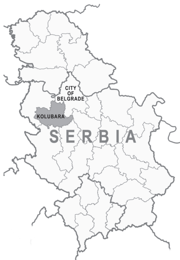
Fig. 1 Map of the Republic of Serbia and position of Kolubara district Slika 1. Karta Republike Srbije i položaj Kolubarskoga okruga

The soil analyses were first performed on the surface of energy plantation in order to obtain data on physical and chemical properties of the soil and soil type. Soil surveys were performed at three locations, and soil samples in the state of disorder were taken