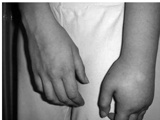
Fig. 1. Fifteen minutes after vaccine injection swelling of the arm, discoloration of the skin with limited range of motion of the arm and fingers was observed.

It is very important to find out whether a patient with regional pain and swelling has other clinical parameters for CRPS I diagnosis. The leading clinical signs for CRPS I are severe regional pain, allodynia, motor dysfunction, emotional distress, vasomotor instability and skin color changes 8,9 . The pathogenesis of CRPS has not yet been