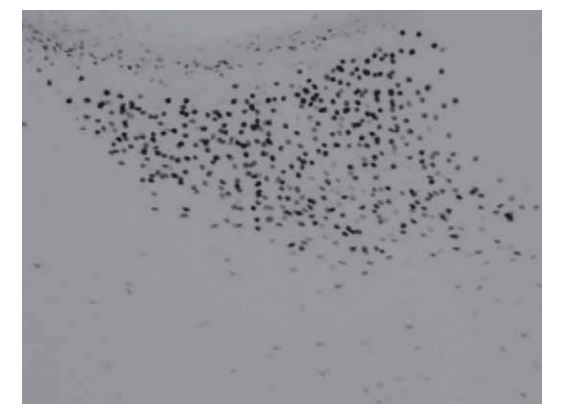
Fig. 3. C-Fos protein immunoreactivity in nucleus supraopticus (transitory ischemia, magnification 20 x).

Positive immunoreactivity (IR) for c-Fos protein was obtained on following locations in cortical, hypothalamic and septal areas: medial prefrontal cortex, parietofrontal