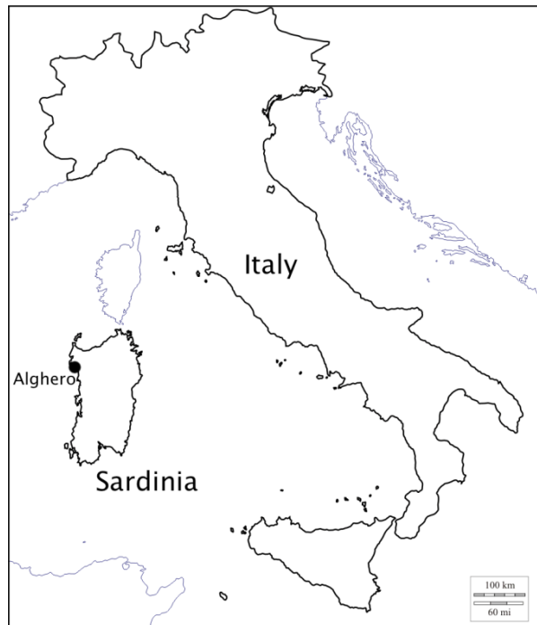
Figure 1: Geographical location of Alghero

The health status of Alghero's population was very poor, as seen by the extremely high incidence of (permanent and temporary) discharge of young men from military service, accounting for over 50% of the cohorts born between 1866 and 1900 at first enrolment (Breschi et al. 2011). Furthermore, conscripts from Alghero initially show a downward trend in physical stature up to 1870-1874, with mean height diminishing from 160.0 cm to 158.2 cm before stabilising at around 158 cm (Manfredini et al. 2013). Malaria was endemic, trachoma was also particularly widespread among children (Melis and Pozzi 2010), and tuberculosis was common (Tognotti 2012) – all clear signs of a continuous and enduring health “stress” afflicting the population.