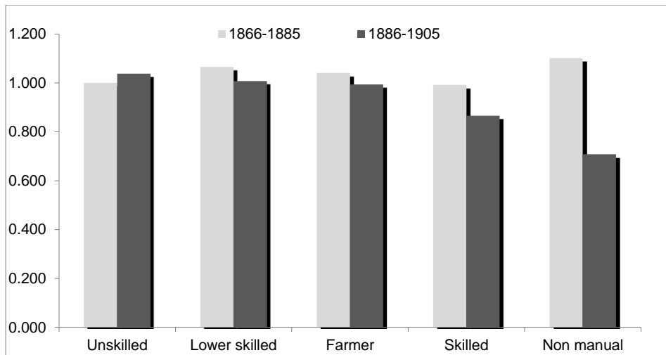
Figure 4: Interactions between SES and Marriage Cohorts (1866–1905)

Lastly, the relative risk of having another child was reduced (by about 10%) for the period corresponding with the First World War and Spanish flu. The results of the interaction with Model 2 (Table 4) show the SES differentials in the marriage cohorts. The non-manual workers experienced a notably significant reduction (40%) of the risk of having another child. These results are even more easily interpreted in the graph below (Figure 4).