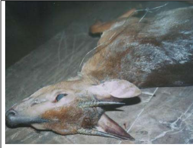
Fig. 4. Suni ( Neotragus moschatus ) caught with a cable snare. taken in one of the villages surrounding NDUFR.