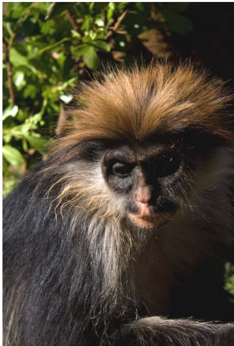
Fig. 1. Udzungwa red colobus ( Procolobus gordonorum ) endemic to the Udzungwa Mountains. Photo by M.R. Nielsen taken in NDUFR.

The Eastern Arc forests of Kenya and Tanzania have, as a component of the Eastern Afrotropical biodiversity hotspot, been ranked among the 34 most biologically diverse areas in the world [4]. The Udzungwa Mountains have the largest area of forest cover within the Eastern Arc and have been considered of particular importance for the protection of biodiversity [5, 6]. Despite the now fragmented nature of forested areas, the Udzungwa Mountains support populations of five mammal species and two subspecies that are endemic to the Eastern Afro-Montane and the Coastal Forests biodiversity hotspot [4] as well as 12 IUCN threatened listed larger mammals (> 400 g). A considerable number of new vertebrate species have also been discovered in recent years (see [6]). The larger endemic mammal species in the Udzungwa Mountains include Abbott's duiker ( Cephalophus spadix ), the newly discovered grey-faced sengi or elephant shrew ( Rhynchocyon udzungwensis ) [7], and three endemic primates: Udzungwa red colobus ( Procolobus gordonorum ) (Fig. 1), Sanje mangabey ( Cercocebus galeritus sanjei ), and the kipunji ( Rungwecebus kipunji ), a newly described genus [8]. It is assumed that forest cover was continuous in recent historical time [5]. Previous logging and agricultural encroachment has fragmented the forests (median natural forest patch area 8.74 km 2 , [9]), reduced available habitats, and led to the threatened status of many of these species.