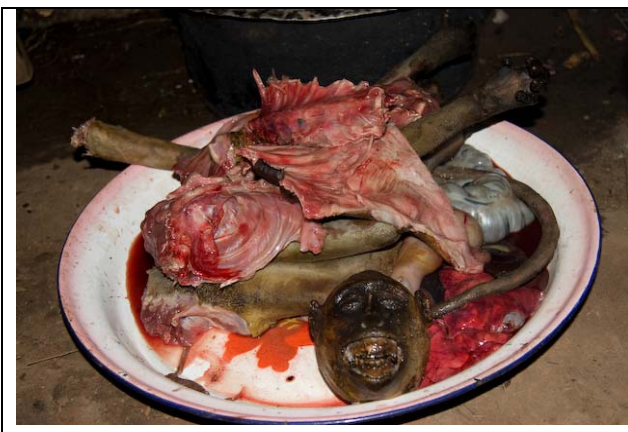
Fig. 3. Sykes monkey on the menu. Photo by M.R. Nielsen taken in one of the villages surrounding NDUFR.

Elephants, buffaloes, lions, and hyenas were recorded only in WKSFR. Medium-sized species (> 16 kg) such as bush pig, Abbott's duiker, and aardvark were significantly less abundant in both hunted areas. Smaller ground-living species had the lowest relative density in the area with the highest level of hunting, while two of three primate species were approximately equally abundant in the two hunted areas. To protect the astounding biodiversity of WKSFR, the Ndundulu, and Nyanbanitu forests and the adjacent Matundu and Iyondo forest reserves have recently been gazetted as the Kilombero Nature Reserve [62]. The status as nature reserve is the highest protection under the Tanzanian Forestry and Beekeeping Division legislation, equivalent to the National Park status of the Tanzania National Parks Authority.