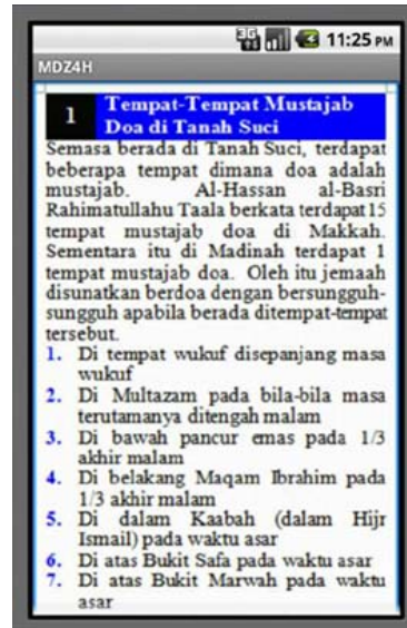
Figure 5. Information Screen

This type of screen contains dua in Arabic with the Malay translation at the bottom plus an audio of the dua recitation (see Figure 6). The user can play the sound and pause it any time and continue playing it again by clicking the speaker icon on the top of the screen. The user can also use the buttons (back, home, and forward). If the pilgrim clicks on one of those buttons while the audio file is playing, the audio sound will stop and proceed to the function related to that button to avoid overlapping audios.