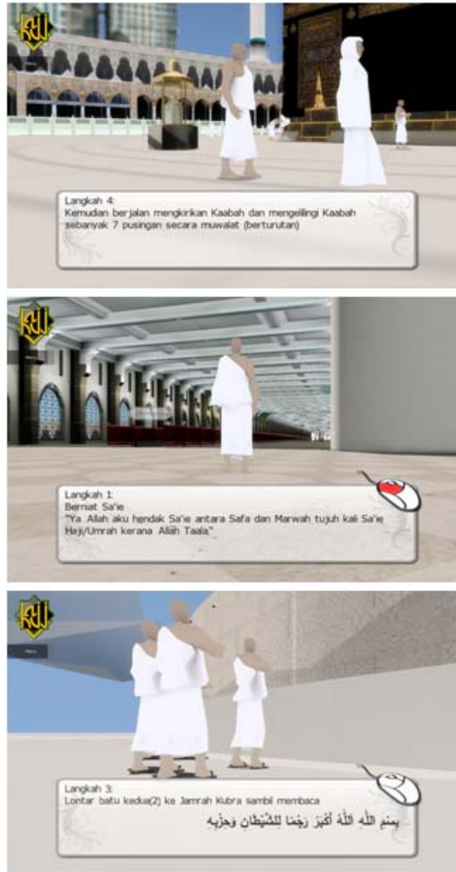
Figure 1. Snapshots of V-Hajj