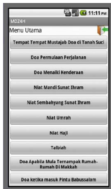
Figure 4. Main Menu

This is the third screen in the application (see Figure 5). This screen contains information and instruction which may be needed by the pilgrims. It informs the pilgrims about the times and places where dua is most acceptable (Mustajab). There are three buttons at the bottom of each screen which allow the user to navigate the system and go through the system screens. The pilgrim can proceed to the next screen by clicking the forward button or can return back to the previous screen by clicking the back button. The user can also go to the main menu by clicking the home button.