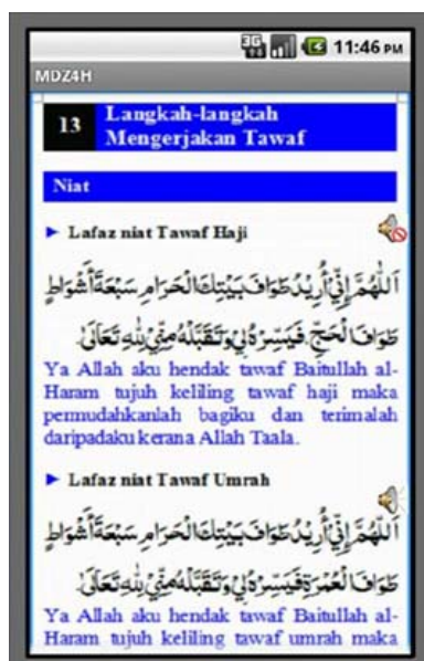
Figure 7. One Page Screen with Multiple Sound Files