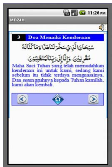
Figure 6. One Page Screen with One Sound File

This kind of screens contains more than one sound file (see Figure 7). The user is allowed to play one audio file only at a time. If the speaker icon is clicked while the dua is still playing, then the audio will stop. But if the user clicked another speaker icon of another Dua while the audio is still playing, then the previous audio file will stop and then the selected Dua audio file will be played.