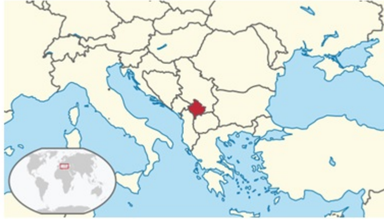
Figure 2: Kosovo in Southeast Europe 7