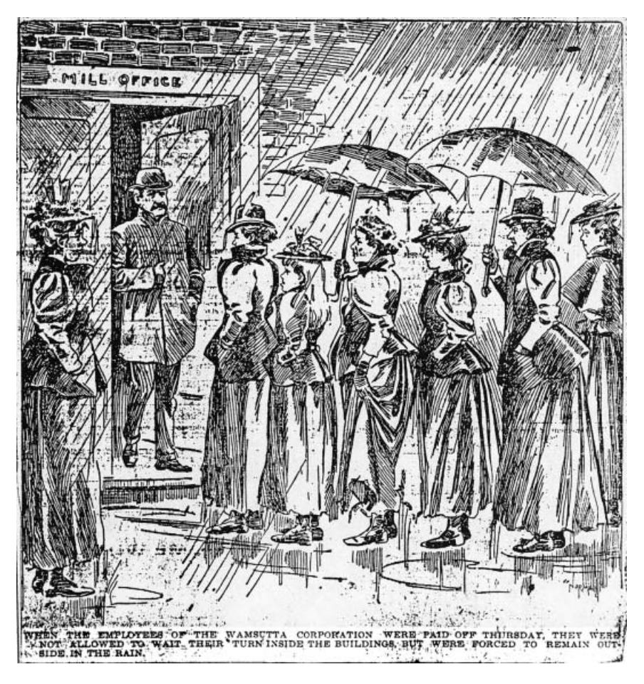
Figure 2. "When the employees of the Wamsutta corporation were paid off yesterday, they were not allowed to wait their turn inside the buildings, but were forced to remain outside in the rain." Women in the New Bedford textile strike line up for their last paychecks from the company. The New York Journal, Monday , 24 January 1898

responded to perceived injustice from within tightly knit communities which linked family life and work life.