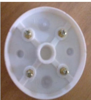
Fig. 5: Junction Box