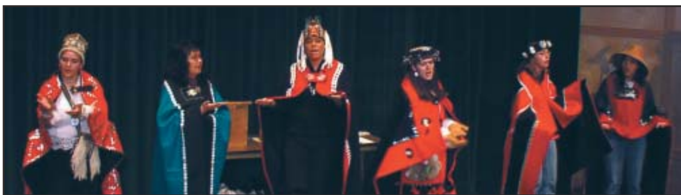
The UAS Tlingit Cultural Dancers performed at the Alaska Native Oratory Society awards ceremony.