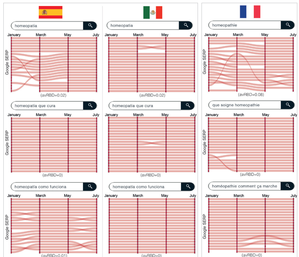
Figure 2a. Fluctuation of the first 20 results in rankings. January-July 2018. Spain, Mexico and France. The four red bars correspond to the four waves of the study. avRBD = Average ranking distance of the ranking deviation

After comparing the fluctuation of the positioning of the web pages in the Google ranking in four different waves (Figures 2a and 2b), we can affirm that there is a general stability in the positioning over time: the average distance of the ranking deviation is minimal or null in all cases. The only ranking that changes the most is the one re-