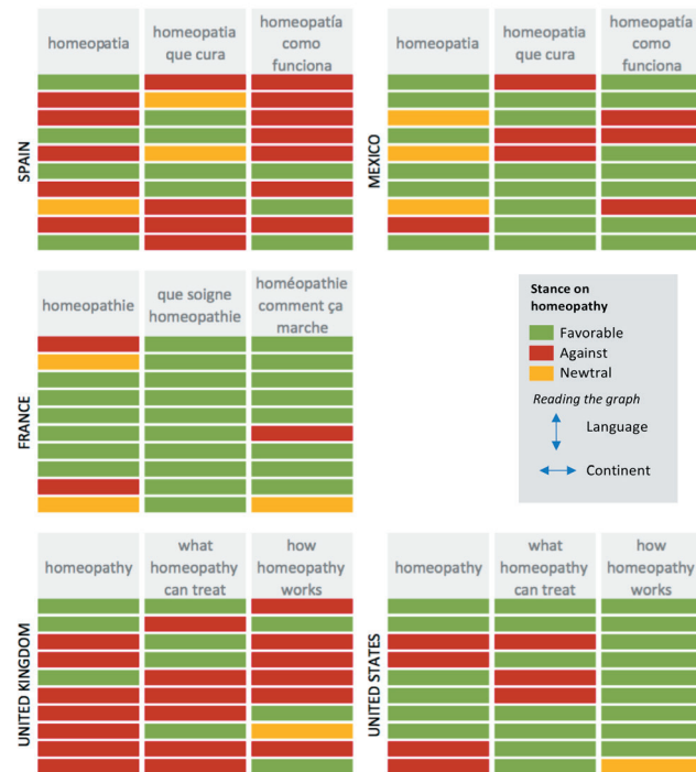
Figure 3. General stance towards homeopathy by the websites in the rankings. The websites are ordered following the SERP ranking. On the left hand side is Europe and on the right America. Above is the Spanish language, then French and below English.

Only in the United Kingdom does a government website appear among the most popular