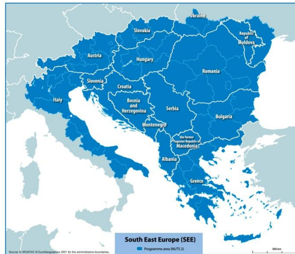
Fig. 1 SEE Programme Area

Therefore, quite generally, correlations must be established from the facts to see and understand the open space in its historical, spatial and social context. Hence the view to the outside is not only essential and substantial for the purposes of monument conservation; the environment also acts as an integrative component of the site on the inside (Böhme 1996).