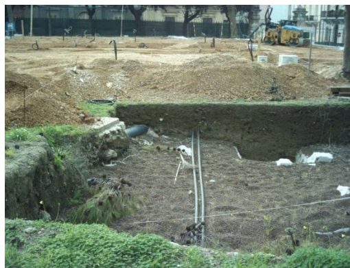
Fig. 2: The excavation site before the construction of a toilet facility for the open-air theatre

This level can be marketed for tourist purposes through the existing images of the historical mosaics.