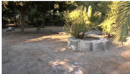
Fig. 7: Video still: Historical fragment in the remote section of the park of the Villa Peripato

In the Italian "Giardino Pubblico" of the Villa Peripato the experimental analysis process using video footage has shown that the specific section of the park where numerous historical fragments are located is precisely the section which has a very withdrawn, remote character with an intimate atmosphere. Hence, a future presentation of the testimony to the historical significance of the park could be realised in this section of the site, since it also offers the opportunity for an unobstructed pursuit of the tracks of the cultural heritage.