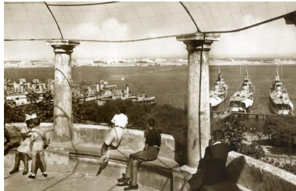
Fig. 4: Terrace overlooking Mar Piccolo, probably around 1930.

Historical research has revealed that park was initially designed (around 1860) as a belvedere/viewpoint. It overlooked the "Mar Piccolo", the bay to the north-east. There were probably two terraces, at least one of which can still be seen on a historical photograph (cf. Fig. 4).