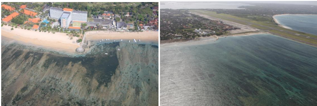
Figure 1: Bali Beach Hotel's waste water treatment tank at shoreline – offshore (BBCP, 2006). Figure 2: International Airport's runway with cross structure by approx. 800 metre (BBCP, 2008)

From the beginning, the increasing growth of tourism in Bali produced a positive outcome with the opening of Bali Beach Hotel (recent name: The Inna Grand Bali Beach Hotel) in 1966 and Ngurah Rai International Airport in 1967. Both facilities are located at Sanur and Tuban/Kuta Beach. Although both facilities had negative impacts on the coastal environment, such as Bali Beach Hotel constructed its waste water treatment tank at offshore (Figure 1) and the International Airport constructed their runway crossing shoreline by approximately 800 meter (Figure 2). It seemed that Bali had been proclaimed as the centre of tourism in Indonesia and expected tourist coming to Bali could spread to other regions in Indonesia.[11] Since then, the development of coastal tourism resorts at Sanur and Kuta had grown without planning and coordination. The unplanned and uncontrolled tourism resorts indicated by lack of infrastructure especially access to the beach, lack of public facilities, worse sewerage system, discharging water disposal to the sea, building frontier offences, and others had led to a high building density and threats of environmental disaster.