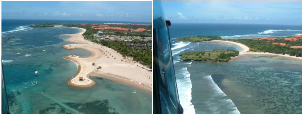
Figure 5: Nusa Dua's aerial photo with artificial reefs as Groins after Project (BBCP, 2006). Figure 6: Two small islands as an identity of Nusa Dua Resort (BBCP, 2006)

From the first step, Nusa Dua was designed as an enclave tourist resort and private resort to avoid the negative impacts of tourism to local culture and community. This private resort was approved by the province and central government. This is because the rationale was good and reasonable; however it means that there was contradiction from the notion of Balinese Hindu Society, and also disagreement from the National Policy in which the beach is sacred and public area (Figure 5). Though an access to two temples which located at the two small islands has been available, the nuance and atmosphere for preparing ritual rites at the temples is strictly different (Figure 6). Because of this sample, the beaches at the northern and southern side of Nusa Dua resort tend to be private, even the beaches at Geger Beach. At those locations, hotel operators use the beaches in front of their property as much as possible, backed up by their security guards.