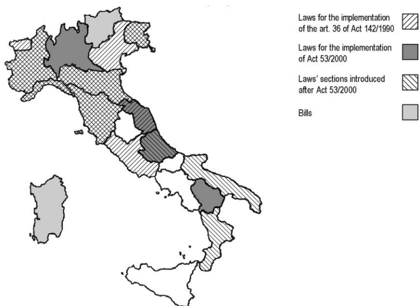
Fig. 1: Italian Regions that have regulations and bills about time policies (Mareggi, 2010: 38). Some regions present different normative tools indicated with over-lapped symbols.