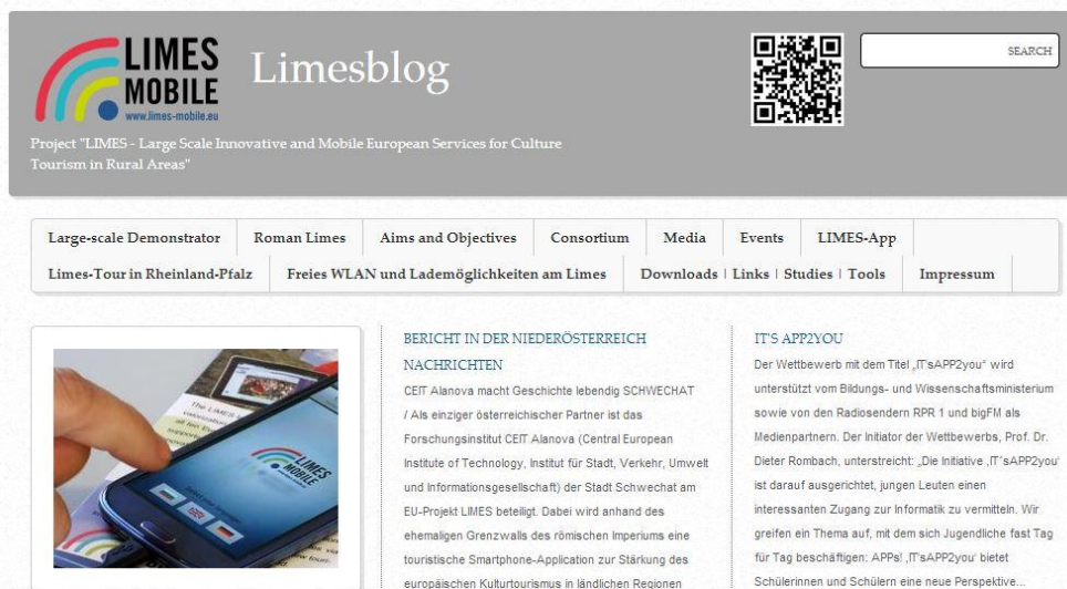
Fig. 1: The common LIMES Blog

At the moment, the LIMES Project operates 6 blogs, micro-blogs and websites in three languages (German, Bulgarian, English): information is passed in a timely and cost-effective manner to a large number of people. Smartphone messages or photos on Project LIMES provide a positive impression of a very abstract project. The first photo of the app prototype was published via digital media.