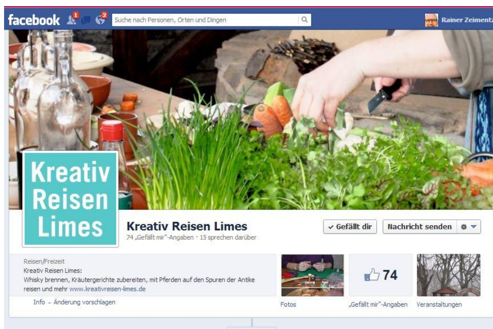
Fig. 2: The Facebook page of Creative Tourism Limes

In addition to the LIMES App, the activities in the Rheinland-Pfalz Limes region are focused on regional services in the 2013 tourist season.