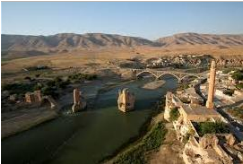
Figure 2: Settlements of Hasankeyf.

This unique and sensitive historical place is declared as first degree Conservation Area (CA) by the Republic of Turkey Ministry of Culture in 1978. Since then the 2005 United Nations Education, Science and Cultural Organization (UNESCO) Operation Guidelines set out the generic key qualities of the unique World Heritage Sites which are also valid for the Hasankeyf CA. The function of UNESCO is to protect and preserve the cultural and natural heritage properties which were developed by different cultures and civilizations through the human history and enlighten the different phases, stages, richness and differences of this common past, by drawing attention on the fact that these properties are increasingly in danger due to not only conventional destruction but also the changing social and economic conditions.