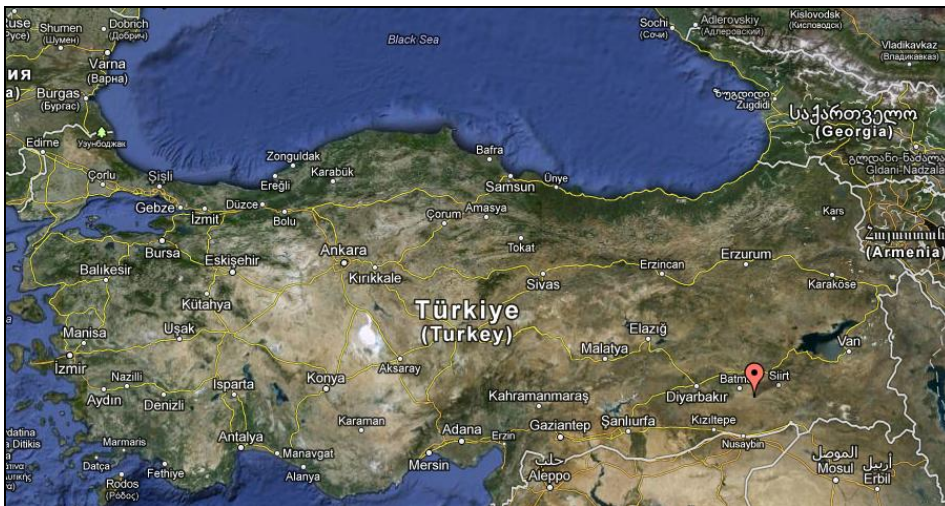
Figure1. Location of Hasankeyf, the WHS in Turkey.

This unique and sensitive historical place is declared as first degree Conservation Area (CA) by the Republic of Turkey Ministry of Culture in 1978. Since then the 2005 United Nations Education, Science and Cultural Organization (UNESCO) Operation Guidelines set out the generic key qualities of the unique World Heritage Sites which are also valid for the Hasankeyf CA. The function of UNESCO is to protect and preserve the cultural and natural heritage properties which were developed by different cultures and civilizations through the human history and enlighten the different phases, stages, richness and differences of this common past, by drawing attention on the fact that these properties are increasingly in danger due to not only conventional destruction but also the changing social and economic conditions.