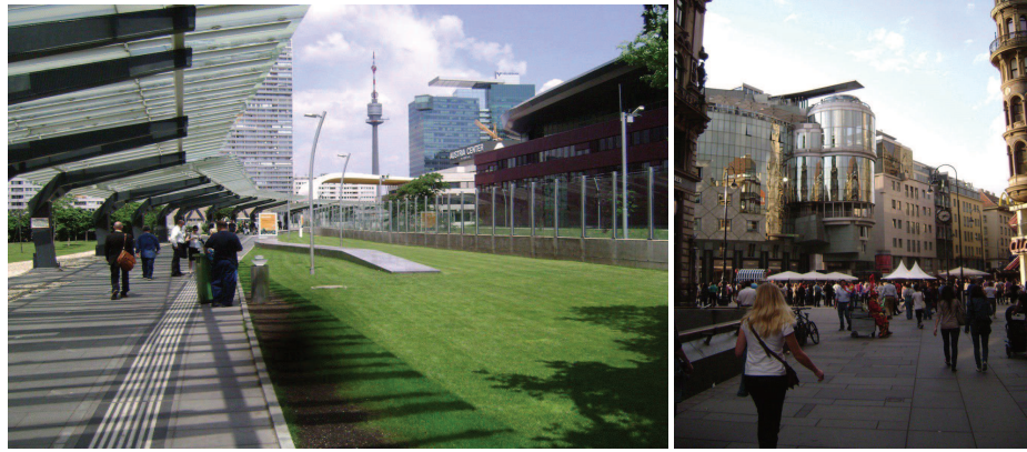
Fig. 4: Vienna tram station (Authors 2012), Fig. 5: Vienna city (Authors 2012)