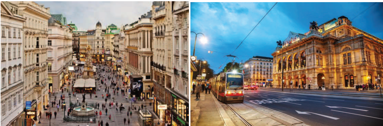
Fig. 2: Vienna Livable city (Berwan, 2018), Fig. 3: Vienna ' tram networks (Lew, 2018)

“Vienna is is the federal capital and largest city of Austria”. In March 2011, the Viennese Smart City Initiative (Smart City Wien) was announced, the stakeholder process was started between (2012-2013) and in June 2014, it was adopted by the city council. “The strategy focuses on the intention of preserving and further evolving the city as a liveable, socially inclusive and dynamic space for future generations. The Viennese smart city approach is based on sparing resource used in order to massively reduce CO2 emissions and dependencies in connection with scarce and finite resources.” (Vienna City Administration, 2014, p.11)