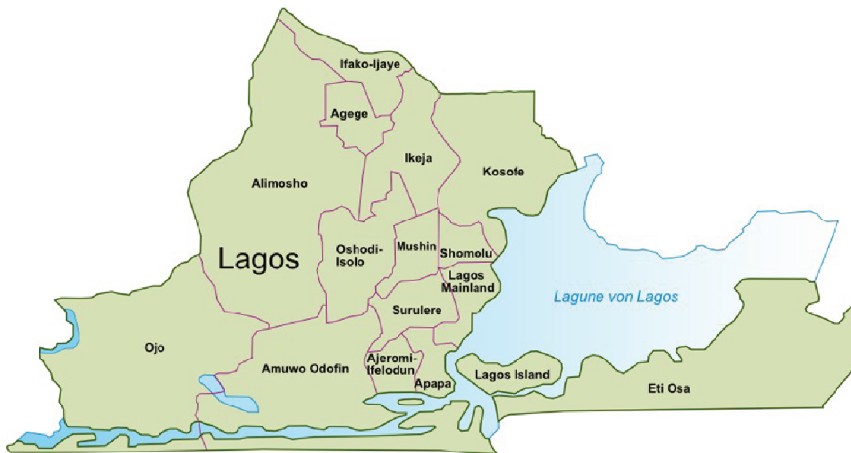
Figure 1: Map of Metropolitan Lagos Showing the Location of Ikeja.

The importance of housing to man is recognised by governments and non-governmental organisations all over the world and has been well rehearsed in literature. In 1948 the United Nations made a milestone declaration which sees adequate housing as a Human Rights Theoretically, this affirms the fundamental human right to a place of residents which should meet his emotional, psychological need for survival and comfort. This premise mandates the government of every nation to take appropriate steps to ensure the realisation of this right.