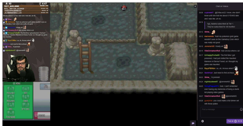
Figure 1: Screenshot of BrownMan’s Twitch stream of Pokémon Soul Silver (2010) from April 23, 2019. On the right side of the image is Twitch’s chat feature, while the left section is comprised of the streamer’s overlays with live gameplay in the middle.

Although Twitch’s recent rise in popularity has helped speedrunning grow as a practice, Twitch acts merely as an interface for speedrunners to engage with and is not central or crucial to the practice itself.