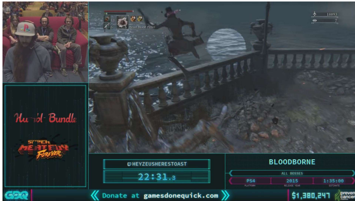
Figure 3: Screenshot of speedrunner heyZeusHeresToast running Bloodborne (2015) during Awesome Games Done Quick 2018.

of over 100 games, each of which will have its own speedrunning group. These groups work collaboratively to help develop new and better ways to speedrun that particular game. And this can be done for just about any