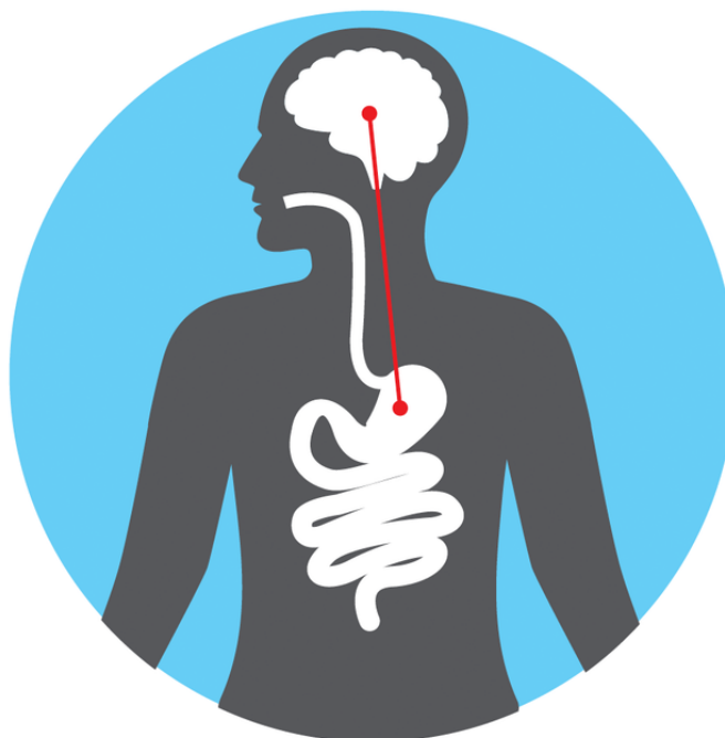
Figure 2. Graphic depicting brain-gut connection.