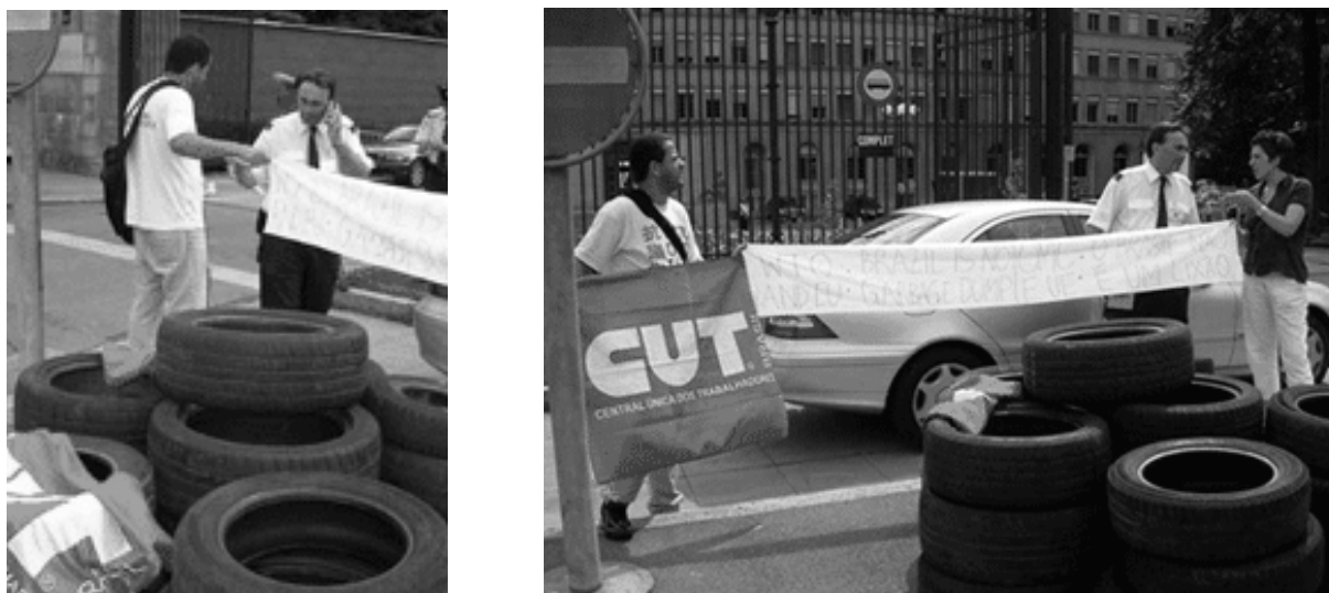
Figure 3: Civil Society Organizations’ Demonstration before the WTO Building on 4 September 2006

Interestingly, one of the main problems cited by the organization was to find environmental and human rights organizations willing to enter the “trade and” agenda. In fact, only after concerted effort did the organization manage to find enough confirmed invitees to hold the initiative. The demonstration held in Geneva also reflected these limitations, in fact, it was a one-man demonstration. With very little help from others, one member of the Brazilian Forum of NGOs and Social Movements for the Environment and the Development (FBOMS) travelled to Geneva, rented a truck filled with tyres and dumped its content before the WTO building while holding up protest signs.