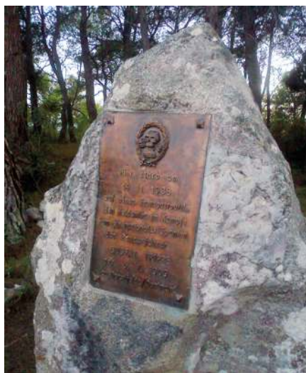
Fig. 12 Monument to German tank officer Gustav Trippe in La Fatarella.

This pseudo-neutral and pacified vision of the war is disrupted every time bones are brought to light. With their involuntary memory they break the dominant narrative and spread panic. In order to re-establish the natural order, the bones have to be kidnapped and taken to Camposines: one place to bring them all – democrats and totalitarians, rightist and leftists, heroes and villains, criminals and innocents – and in the darkness bind them. Not in the Land of Mordor, but in the Ebro, where the shadows (also) lie.