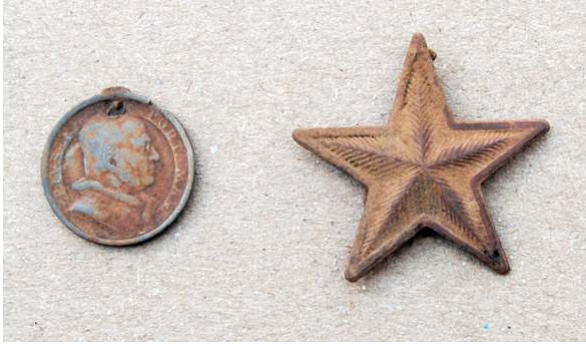
Fig. 1 A medal of Pope Pius XI, in all likelihood belonging to a Nationalist soldier, and a red star of the uniform of the Popular Army of the Republic. They appeared only a few centimeters apart (Abánades, Guadalajara).

sheltered for a while and resisted the Republican advance. We found abundant evidence of the combat, including exploded artillery and tank shells, mortar rounds and grenade fragments, pistol and rifle shell casings and a large amount of incoming bullets. We retrieved also things more intimately related to the soldiers that were involved in the fight, such as religious medals (one of Pope Pius XI and another of the Christ of Limpías, a place in northern Spain), a tag showing membership to the Spanish Fascist Party ( Falange Española ), a cuff link, military insignia (including a red star of the Republican Army), coins, a toothbrush ... (Fig. 1).