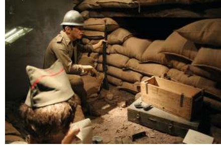
Fig. 8 One of the displays in the museum of Corbera d'Ebre.

in the Memorial de Camposines. This is an ugly monument built in one of the most beaten areas of the Battle of the Ebro (Fig. 7).