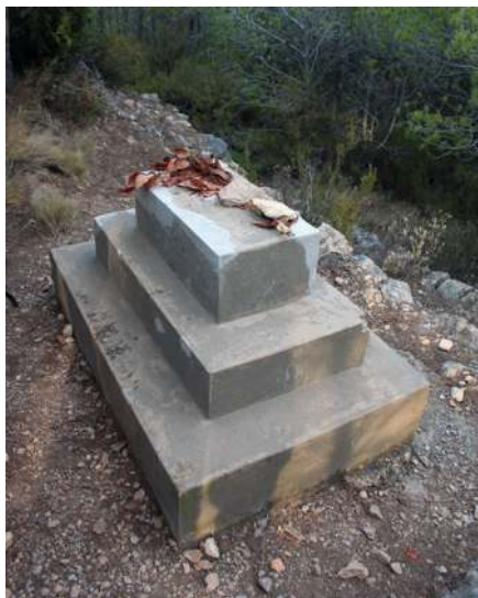
Fig. 11 Restored monument of the International Brigades to their fallen comrades.