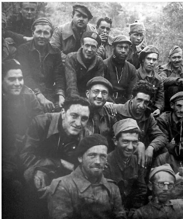
Fig. 9 Photo of a group of international brigadists shown in the museum of La Fatarella.

military details, territorial gains and losses, weaponry, uniforms and daily life. Perhaps where the trickiness of the Memorial Democràtic is best exposed is in the center devoted to the international participation in the battle, which is located in La Fatarella. If one was expecting a museum on the International Brigades, one would be disappointed. There is nothing wrong, however, with the idea in itself: “The exhibition examines the political aspects and international diplomacy linked to the Spanish conflict, and volunteer movement, which emerged in response to the non-intervention of democratic countries.” 47 The problem is that, as it happens in the other centers, both sides are presented equally: thus, hanging on one wall we have photographs of international brigadists (Fig. 9), and on the other Italian, German and Moroccan troops fighting for Franco (Fig. 10).