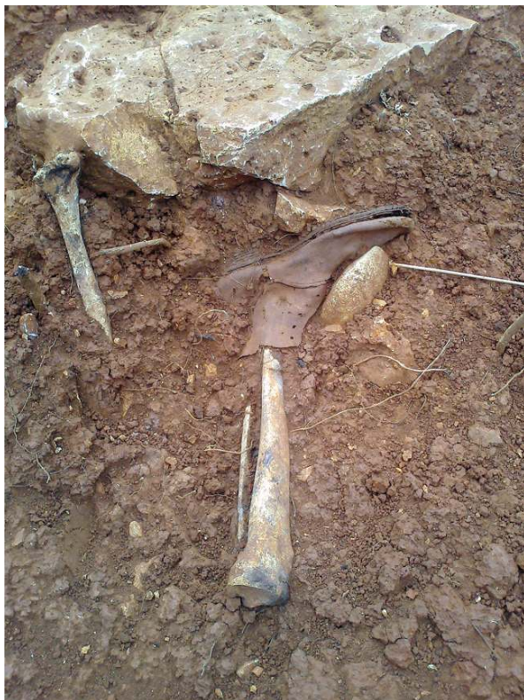
Fig. 2 Part of a leg of a Nationalist soldier hit by artillery fire near Abánades.

related to the killed, who came from all parts of Spain. There was however the impression among people from the local association that the appearance of human remains could ‘politicize’ the project, which was regarded as ‘apolitical’ until then. This is an interesting issue. On the one hand, there is the idea that excavating corpses immediately associates a project with the search for the Republicans assassinated during and after the war, which is carried out within a political framework. 20 On the other hand, people grant bones an extraordinary agency: bones can derail history, at least history of the pacified kind. This is surprising since it is not at all strange that bodies of soldiers appear in a battlefield. The reason people feel alarmed, apart from the ‘contamination’ from the historical memory campaign, is that, after all, dismembered, wounded bodies remind us in an unambiguous way how the war was (something quite removed from epic military stories), but, more than that, it shows that the war simply was . It is not the obscenity of