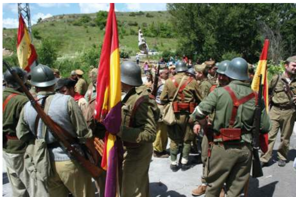
Fig. 4 The hug that never was: reenactors embrace after the reconstruction of an episode of the Forgotten Battle.

from the association Frente de Madrid, 22 with whom we had contacted in 2008. They dressed as Nationalist soldiers (we were excavating a Nationalist position then). After this experience, the local historical group and the reenactors decided to organize a major living history performance to commemorate the battle. This has taken place yearly since 2010 under the evocative title ‘The forgotten battle.’ We have collaborated in the first two events giving lectures on our archaeological excavations. Other activities are also organized by the local association, such as guided visits to the museum, a short film competition, a photography exhibition and music performances in which Spanish songs from the 1930s are interpreted by artists dressed in war-era clothes. In this memory network, that includes more and more actors every year, archaeologists play just one role – and not necessarily the most important one.