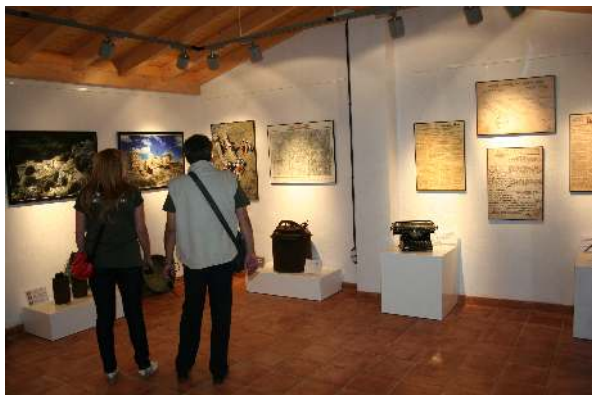
Fig. 3 Displays in the Museum of Abánades.

violence which is in itself important, but rather the realization of the fact that this happened here 21 – this unspeakable violence that we tend to associate with remote places, peoples and eras. The dead from recent conflict convey an uncanny impression of a warning or a threat. For some reason, it is regarded as indisputable evidence, more than trenches, artillery fragments or cartridges. In any case, despite initial misunderstandings with the major, the situation in Abánades was clarified and no obstacles were created to our research by the authorities or other instances – quite the opposite. We managed to make clear that, notwithstanding our political sympathies, we were first of all scientists that employed a scientific method to recover material evidence of the war – tin cans, bullets, trenches or human bones – and that we did that with the utmost respect for the dead.