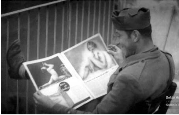
Fig. 10 Photo of one of Mussolini's soldiers shown in the museum of La Fatarella.

and transmitting democratic values. Building a mausoleum to put together those who strove to destroy democracy and impose a fascist-style dictatorship with those who were fighting on the side of a legitimate, constitutional government does not seem to buttress democracy either. This does not mean that a partisan display, one that celebrates a set of values and decries others, has to be acritical. Of course, there were many fighting on the Republican side who were anything but democrats in any imaginable sense or sensitive to human rights (such as Commander Lister or the brutal FAI assassins). In fact, that the repression in Republican-controlled Catalonia was among the bloodiest in Spain has to be fully acknowledged. Yet I am not saying that we have to give a eulogy of the Republic. Forgetting the painful, murky aspects of history is neither emancipatory nor democratic, but neither it is to put all sides at the same level.