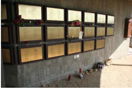
Fig. 7 Memorial of Camposines with plaques remembering fallen soldiers.