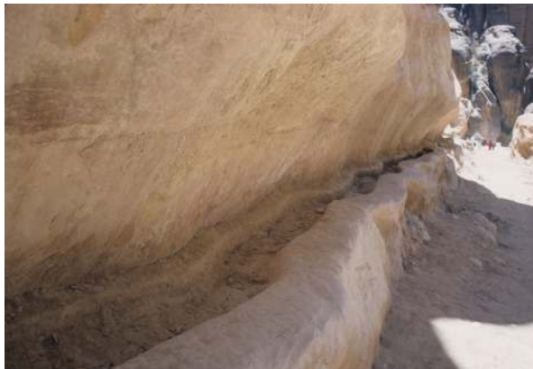
Fig. 7 Aqueduct channel in the Siq, Petra.

to a uniquely arid and stony landscape in Arabia Petraea and the Hejaz, with transformative results. The dry environment and low population have also fostered remarkable preservation of the structural remains.