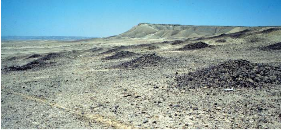
Fig. 15 Stone piles, Sobata.