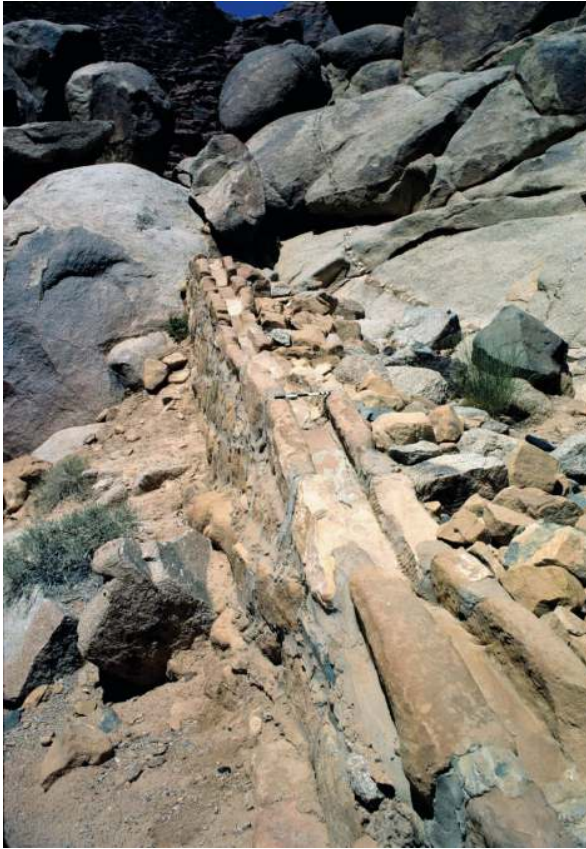
Fig. 14 Aqueduct channel, Ramm.

side terraces. An area of at least 253 ha was prepared for agriculture in this manner, beginning in the Nabataean period. This irrigation system illustrates techniques that could have been applied at Hawara to make use of the braided flow in the wadis that pass by the site, but which apparently were not.