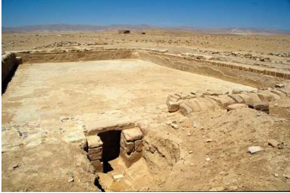
Fig. 10 Nabataean pool fed by aqueduct, Hawara.

sites. Both systems also fed reservoirs or pools that made the water directly available or serviced local pipe systems. The aqueduct system at Hawara discharged its water into a large shallow pool ( 27.6 \times 17 m, depth 1.34 m) with a capacity of 629 cubic meters (Fig. 10).