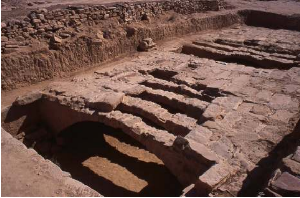
Fig. 11 Nabataean arch-roofed cistern, Hawara.

One disparity is that only one cistern and one reservoir at Hawara were provided with stairs into the pool to facilitate periodic cleaning, a feature that was common at Petra. It is possible that the settling basins commonly associated with cistern intakes at Hawara represent a local practice that made frequent cleaning less urgent. Settling basins were only rarely associated with cisterns at Petra.