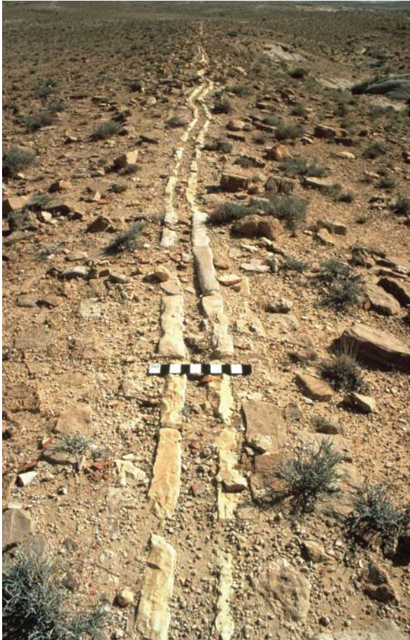
Fig. 8 Nabataean aqueduct channel to Hawara.

Gutter blocks of the same design appear where necessary in the Petra system, but the main channels were often slightly larger than at Hawara, to accommodate the greater flow of the springs. In all the cases where the capacity of the conduits or pipelines serving Petra has been calculated, the potential maximum flow seems far in excess of the probable available spring flow. The calculated capacity of the conduits in the Siq alone (208 cum/hr), for example, is 34 times the recent discharge of the 'Ain Musa. The same disparity was noted for the Hawara aqueduct system as well (2.2–19.6 cum/hr), although only at a factor of 4.5. 21 Since it is unlikely that either spring was correspondingly more abundant in antiquity, several technical explanations for this over-building are possible.