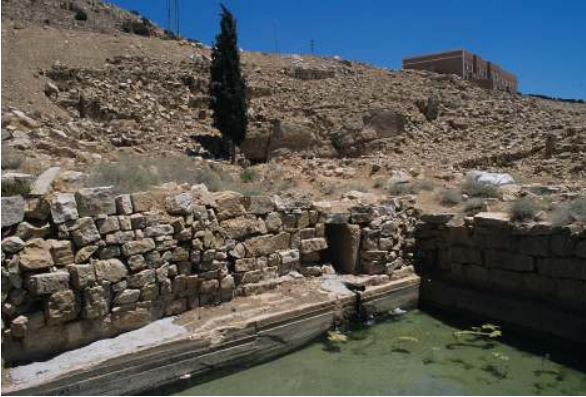
Fig. 3 View of 'Ain Brak, Petra.

and cisterns to store the run-off. This run-off water was directed to reservoirs and agricultural fields by shallow earthen channels. The same goes for Umm el-Jamal and the other sites that flourished in the Hauran during the Nabataean period. All of these techniques were in use in the region since the Bronze Age.