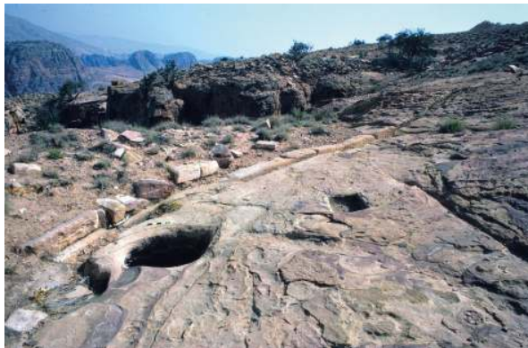
Fig. 4 Iron Age Cistern, Umm Biyara.

the case? What is the cultural flavor of hydraulic technology in this large and varied region, and what does it tell us about Nabataean culture in general? First, we must consider the origins of these techniques.