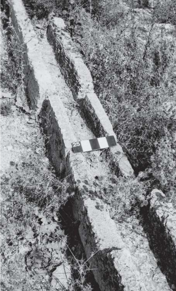
Fig. 5 Late Bronze Age conduit blocks, Ugarit.

be seen at Nabataean sites such as Umm el-Jimal and Sobota. 9 By the Late Bronze Age rock-cut conduit blocks were a well-known method that was used throughout the eastern Mediterranean and the Levant (Fig. 5).