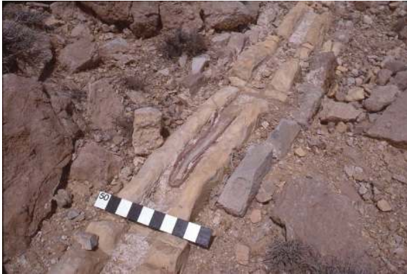
Fig. 9 Nabataean aqueduct with inverted roof tiles added, Hawara.

First, the excess capacity gave the engineers greater leeway for errors in leveling and calculation of gradient when dealing with constantly changing slopes; a larger channel area made it less likely that poor leveling would cause an overflow of water that would damage the aqueduct structure. Alternatively, the excess capacity could have been meant to compensate for the formation of calcium carbonate deposits in the channels and pipes over the decades. Sinter seems to have been removed regularly from the Hawara conduits, since the deposits surviving in the conduits usually show only four to 10 annual growth rings, and chunks of discarded sinter are found there and along the course of the aqueduct. It was more difficult to clear pipes, and one pipeline in the Siq at Petra finally became so clogged with sinter that the pipes were broken open to allow unconfined channel flow. 22