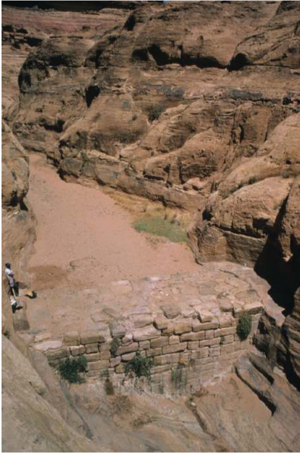
Fig. 13 Nabataean dam, Hawara.

northwest of Petra in the Wadi Arabah. Although the function of the settlement was very different from that of Hawara, and much of the water supply in the Byzantine period was intended for use in processing ore, there are some similarities in topography and in soil and water resources. A recent survey catalogued a few structures similar in function to those at Hawara, but later in date and following the Roman design traditions: an aqueduct, reservoirs, a few cisterns, and two dams. 31 The most prominent surviving remains of the water-supply system of Phaino are the numerous field boundaries built of water worn boulders, barrier walls with spillways, and earthen, stone framed water conduits built on and just above the wide, braided plane of the Wadi Faynan. Barrier walls diverted and guided the flowing water and delayed it so it could soak into the soil. The survey recognized 85 simple field systems, 10 complex field systems, and 6