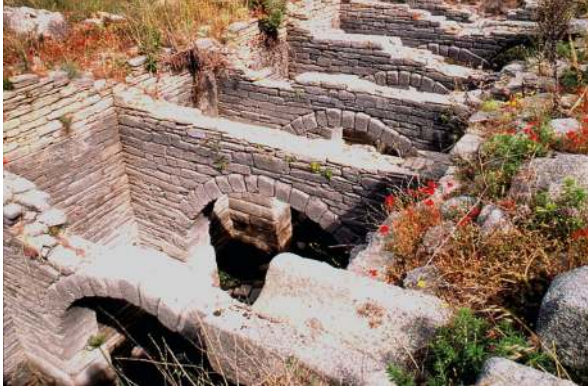
Fig. 6 Theater cistern, Delos, 3rd century BC.