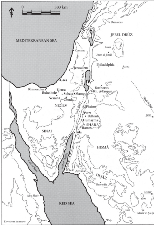
Fig. 1 Locator map of Humayma.

At the start, I have to emphasize that the variety of environmental conditions across Nabataean territory presents some problems for any hypothesis of a unitary Nabataean technology. 3 The northern portion of the kingdom, which I can only touch upon in this context, was relatively well watered and well endowed with agricultural land. For these same reasons, this region was also rich in traditions of water management and water supply that originated as early as the Bronze Age, and were modified or supplemented by various regional cultures through the Hellenistic period. At present, the annual precipitation at Damascus averages 202 mm, which is below the threshold for grain production, but the Barada River, originating in the Anti-Lebanon mountains, has emptied into the al-Ghutah oasis since antiquity, on the edge of which Damascus was founded long before the Nabataean hegemony, allowing irrigation agriculture. The site of Bosra to the south, in contrast, receives only 150 mm of rainfall a year, and must rely on reservoirs