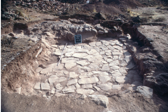
Fig. 3 Upright stone monolith surrounded by low stone wall at site of Q'enko located above and outside the city of Cuzco.