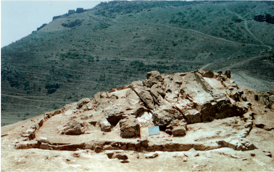
Fig. 1 Photograph of Summit Temple at the site of Pueblo Viejo consisting of carved rock outcrop surrounded by low stone wall.

ducted in very close proximity to a significant natural feature that I would not hesitate to identify as a huaca . The presence of cooking and serving vessels around the modified outcrop, the evidence for cooking fires, and the finds of camelid bone indicative of meat consumption strongly suggest that this was a site of ritual commensal activities. I would posit that these activities were conducted at this location for the specific purpose of including the huaca in the affair, thus recognizing its “personhood” and forging or reaffirming its relationship to the local community.