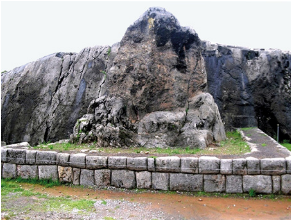
Fig. 4 Upright stone monolith surrounded by low stone wall at site of Q'enko located above and outside the city of Cuzco.

In other parts of the Andes, upright monoliths, sometimes demarcated by stone platforms or other enclosures, were also clearly recognized as huacas (Fig. 4). Various such monoliths located throughout the Callejon de Huaylas region of the central highlands of Peru are identified still today by local communities as sacred sites. In a recent survey of the region, limited test excavations were conducted adjacent to one of these monoliths. 36 The 1 × 2 meter excavation unit reportedly produced dense quantities of undecorated domestic pottery, together with camelid, deer, and cuy (guinea pig) bones. These materials were interpreted as evidence of large-scale feasting carried out in direct association with the huaca . 37