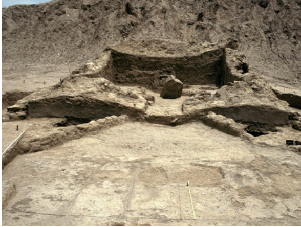
Fig. 5 Temple of the Sacred Stone at the site of Tucume on the north coast of Peru.

Further to the north, at the important late period site of Tucume on the Peruvian coast, excavators uncovered a small structure with a large, deeply embedded monolith in the center (Fig. 5). The building was subsequently designated the Temple of the Sacred Stone. Numerous offerings were found in pits located directly below and in front of the stone huaca consisting principally of spondylus shell and miniature representations of objects such as pottery vessels, corn, plants, birds, fish, jewelry, tools, and musical instruments all produced in sheet metal. 38 The researchers describe in particular a series of miniature metal vessels consisting of a double-spout and bridge bottle, a high neck jar, and two plates. Such items, I would suggest, could all be construed as accoutrements of ritual feasting rendered particularly fit for an extraordinary personage through their miniaturization and their production in precious metal.