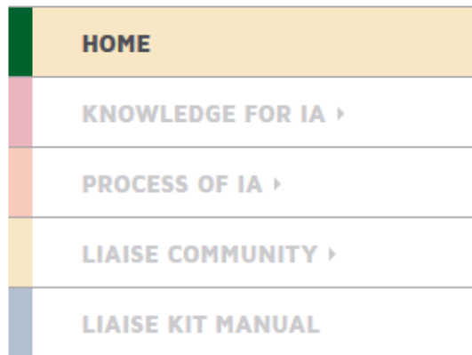
Figure 2: LIAISE KIT navigation menu

In the following, the main content and features of the IA library will be explained following the navigation menu (Figure 2).