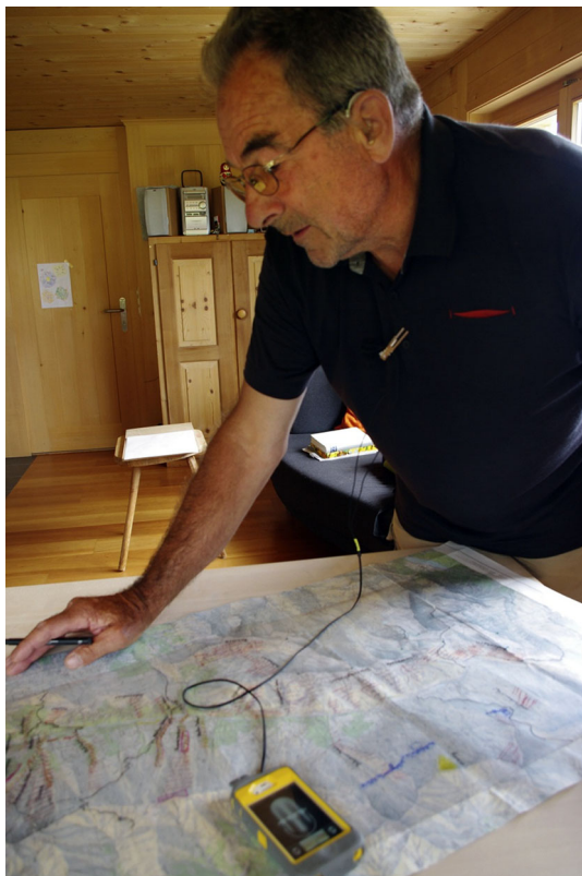
Fig. 3 Recording an audio material for a multimedia map with a former carpenter. Photograph by C. Reichel, Tenna, July 2012