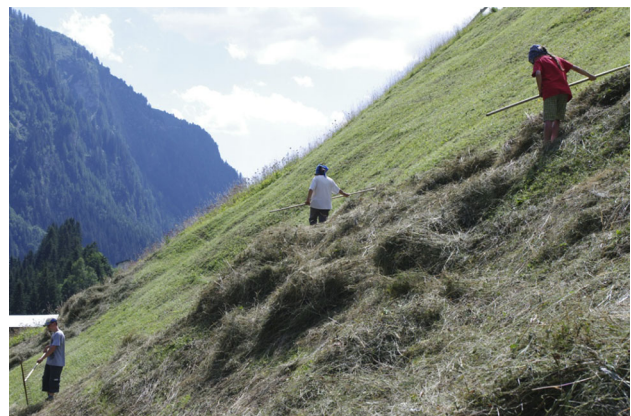
Fig. 4 Traditional haying techniques of scything by hand. Photograph by C. Reichel, Safien Platz, January 2012