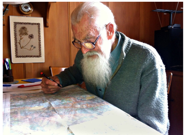
Fig. 2 Scale mapping of natural hazards with a former district forester and farmer family in Safien, Switzerland. Photograph by C. Reichel, Safien Platz, January 2012

The use of multimedia maps—the combination of video and audio material with a georeferenced map—offers a particularly valuable possibility for visualizing the hidden structures of environmental knowledge and enables the researcher to analyze the deep connection of this knowledge to the people's perception of the environment (Ingold 2000). The multimedia