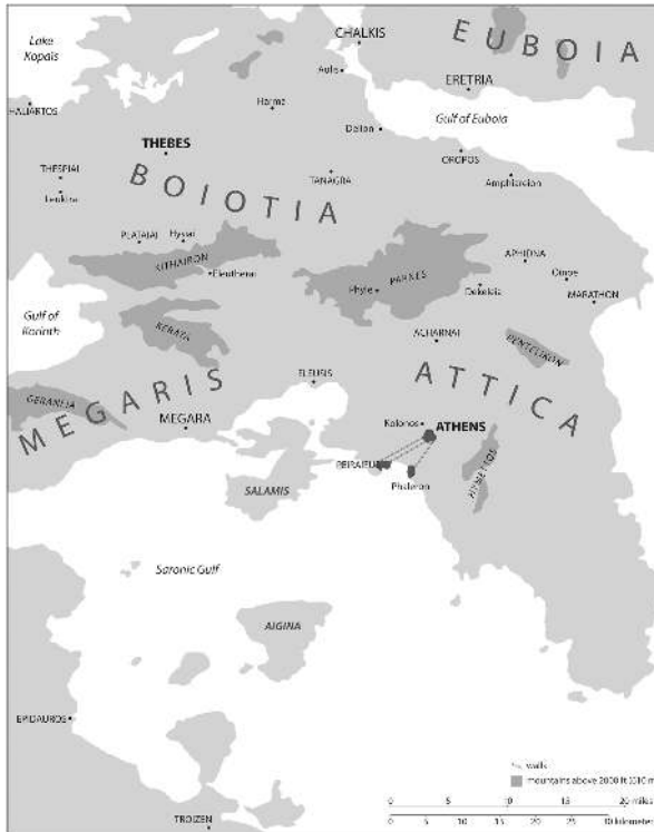
Fig. 2 Map of Attica and environs.

that a Boiotian village near the Attic border was called Harma (Chariot), either after the chariot of Amphiaraios, the seer of the Seven, or after that of Adrastos. 120 According to the latter myth, Adrastos – after the crash of his chariot in Harma – “saved himself on Areion,” 121 just as in the epic Thebaid . 122 Strabo mentions another Harma across the border in the vicinity of the Attic deme of Phyle. 123 The people living near this chariot-shaped mountain top also sought a connection to Adrastos’ chariot, but, in their version, the horse Areion apparently played no role: “Adrastos was saved by the villagers,” 124 who might have escorted him to their king, as Jacoby suggests. 125 Another place in Attica, Kolonos Hippios (Horsehill), 126 located two kilometers north of Athens on the road to Thebes, was also connected to Adrastos’ flight. There was “an altar to Poseidon Hippios