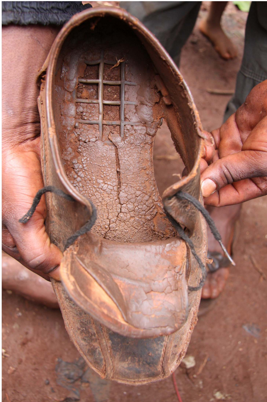
Figure 3. Shoe of an adolescent from rural Kenya after 6 months of use. doi:10.1371/journal.pntd.0003133.g003

tungiasis is reported are low-income and lower middle-income economies where this plague afflicts the same marginalized population segments and communities affected by the already-recognized NTDs. The same inequity issues and complex social determinants as in the field of the NTDs have perpetuated the transmission of tungiasis in resource-poor communities